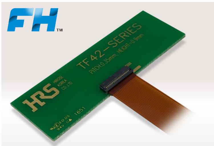
FH Flip-Lock Pioneer Hirose