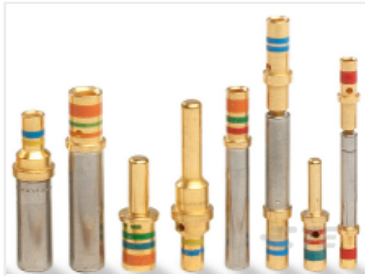
TE Part #81543-16 CONT SOC ASSY