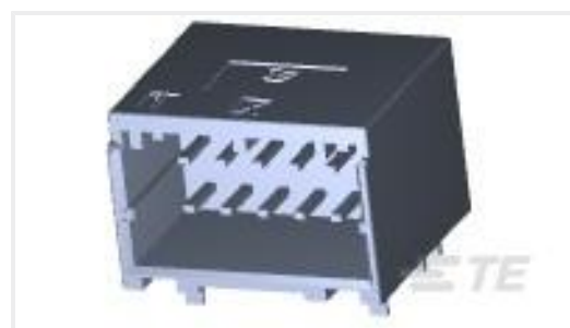
TE Part #1-1827876-6 DYNAMIC 1200D HDR ASSY H 12PX BLACK GOLD