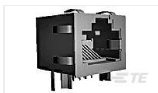
TE Part #1-406541-8 MJ,INV,1X1,0PNL G,.100"ST,SN