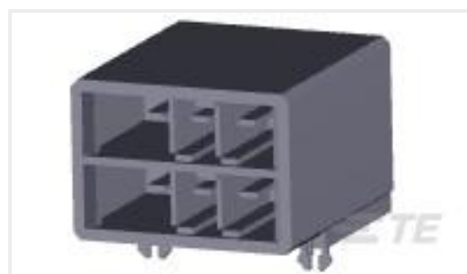
TE Part #1-178139-2 DYNAMIC 3200 HDR H 6P ASSY