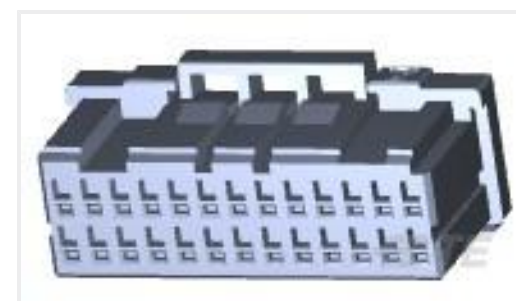
TE Part #1-1827863-3 DYNAMIC 1100D REC HSG X 26P BLACK