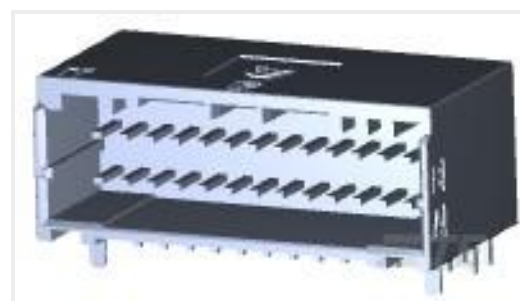
TE Part #1-1939638-4 DYNAMIC 1100D HDR ASSY H 28P XBLACK GOLD