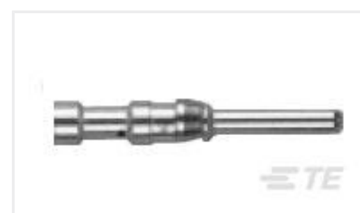
TE Part #1-1105300-2 HVT-C-Sti.Au.0,5 qmm