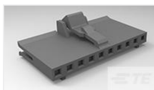
TE Part #1-487526-4 015 HOUSING FFC RCPT 100CL SR