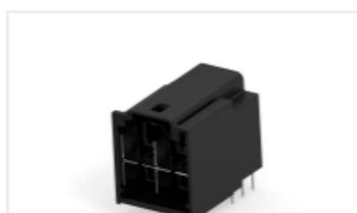
TE Part #2391079-1 Matenet, header, 2x2 port, code A