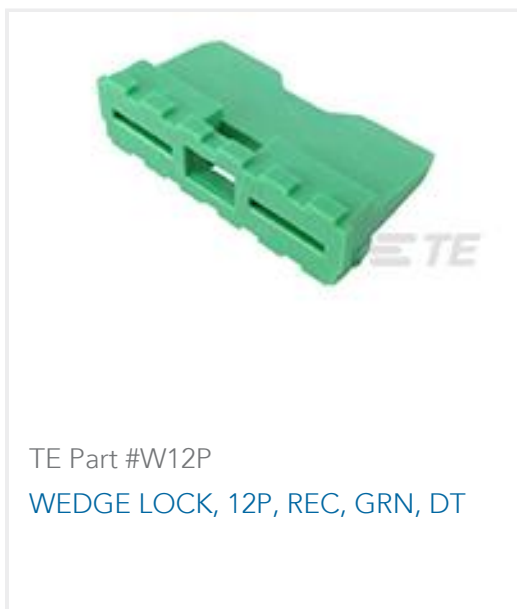
TE Part #W12P WEDGE LOCK, 12P, REC, GRN, DT