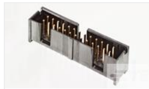
TE Part #5103308-3 A/L LOW PRO HDR 16P VERT BLACK