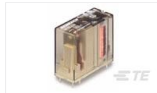
TE Part #1-1393230-1 RP3SL024