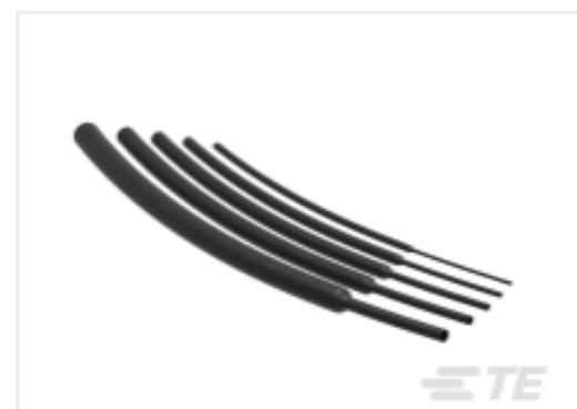
TE Part #NB20274001 VERSAFIT-3/16-0-SP