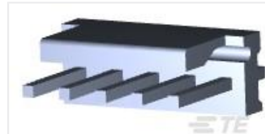
TE Part #640445-5 05P MTA156 HDR ASSY FL/STR SN