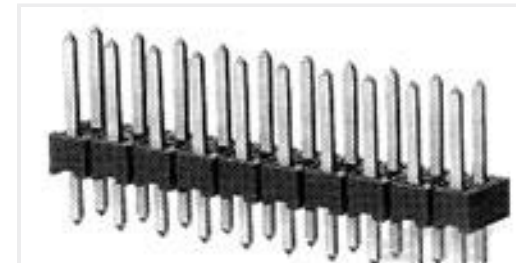
TE Part #9-146253-0 80 MODII HDR DRST B/A .100CL L