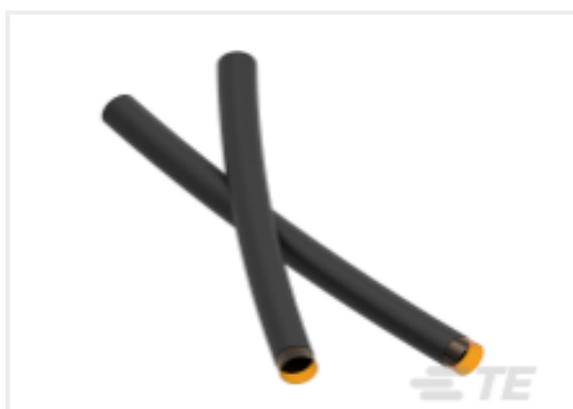
TE Part #NB14032001 TAT-125-3/16-0-STK