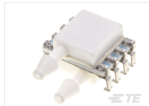
TE Part #4525-DS3A001DP 1PSI DP PRESSURE SENSOR 10% TO 90%