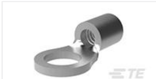
TE Part #32994 TERMINAL, SOLIS R 12-10 8