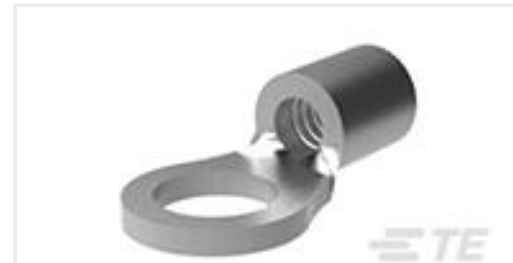
TE Part #322447 TERMINAL, SOLIS R 12-10 4