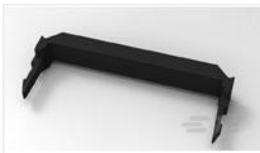
TE Part #499252-8 016 STRAIN RELIEF A-L RCPT