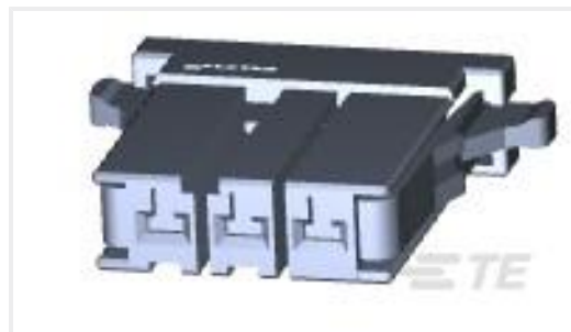
TE Part #1-178128-3 DYNAMIC 3200 REC HSG 3P SGL