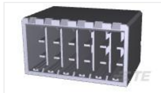
TE Part #316516-5 DYNAMIC 3500 HDR ASSY 12P V