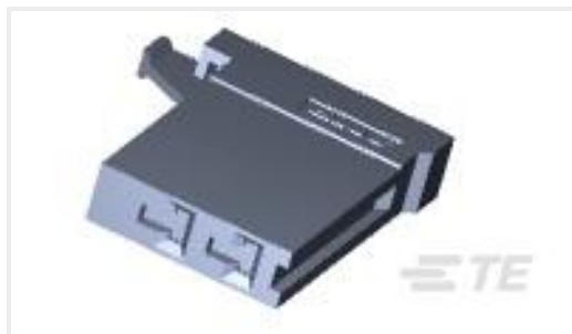
TE Part #175362-1 DYNAMIC D-3500 REC HSG 2P