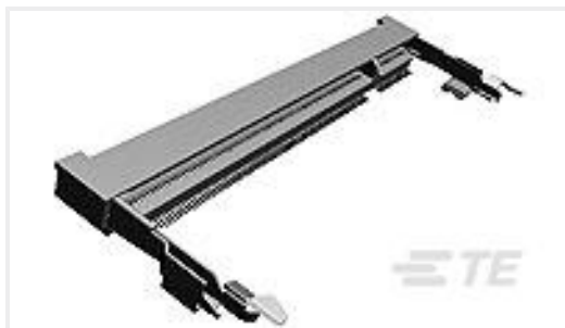
TE Part #1473005-4 SEMI-HARD TRAY DDR2 SODIMM SOCKET 200P 5