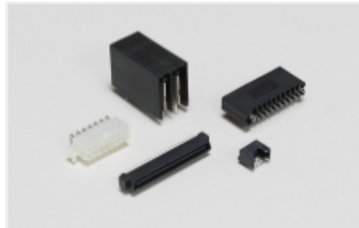
Standard Rectangular Connectors(2)