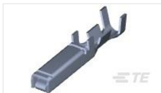
TE Part #1-175195-5 DYNAMIC D-3 REC CONT/M PRE-TIN