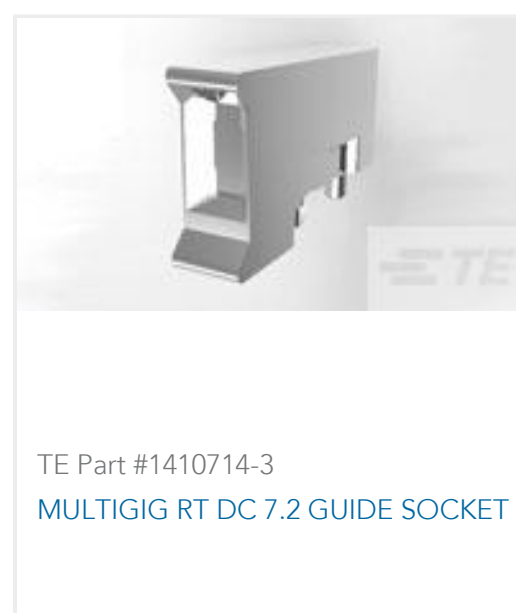
TE Part #1410714-3 MULTIGIG RT DC 7.2 GUIDE SOCKET