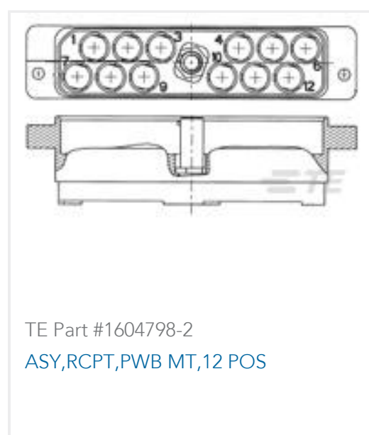
TE Part #1604798-2 ASY,RCPT,PWB MT,12 POS