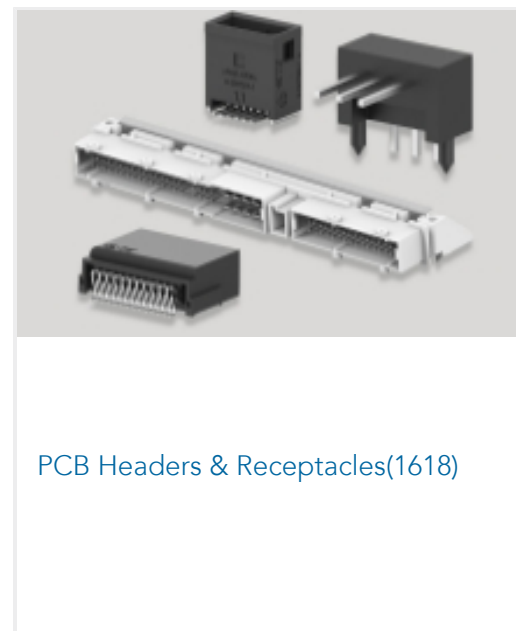
PCB Headers & Receptacles(1618)