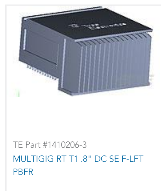
TE Part #1410206-3 MULTIGIG RT T1 .8" DC SE F-LFT PBFR