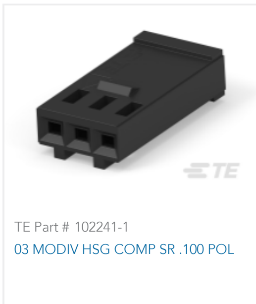
TE Part # 102241-1 03 MODIV HSG COMP SR .100 POL