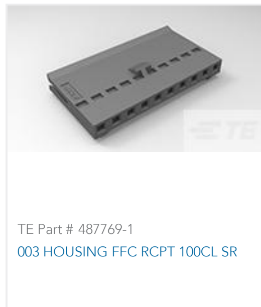
TE Part # 487769-1 003 HOUSING FFC RCPT 100CL SR