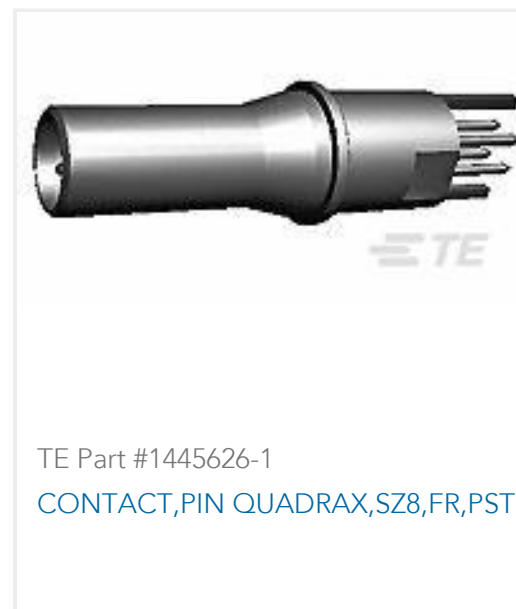
TE Part #1445626-1 CONTACT,PIN QUADRAX,SZ8,FR,PST