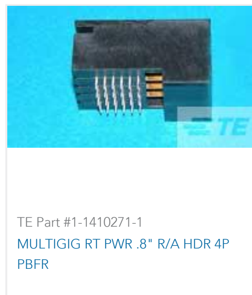
TE Part #1-1410271-1 MULTIGIG RT PWR .8" R/A HDR 4P PBFR