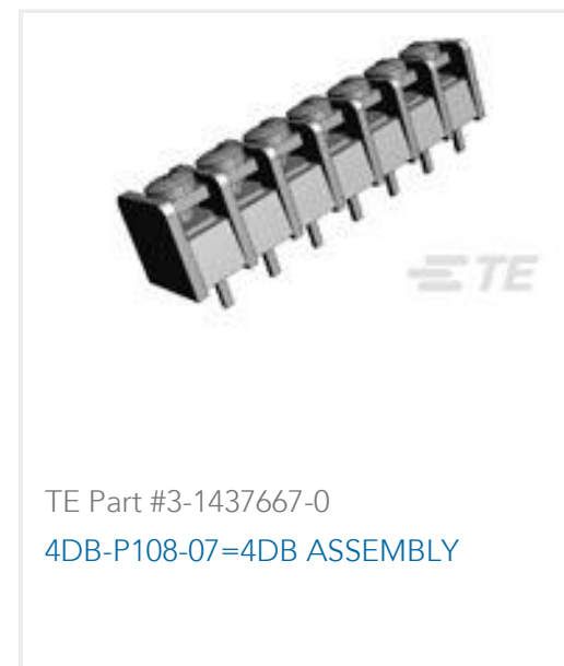
TE Part #3-1437667-0 4DB-P108-07=4DB ASSEMBLY