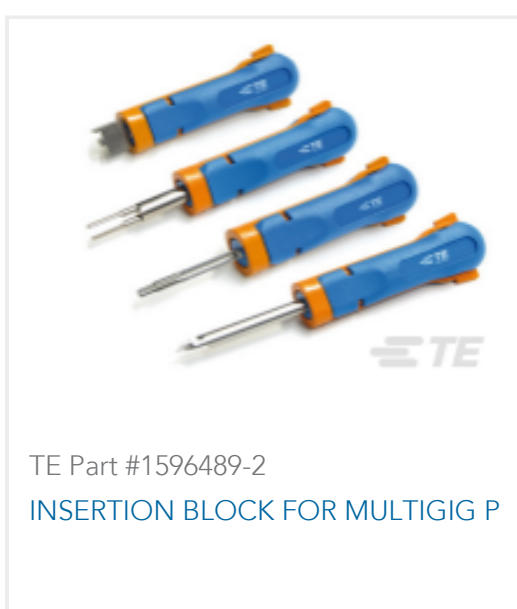
TE Part #1596489-2 INSERTION BLOCK FOR MULTIGIG P