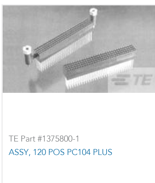
TE Part #1375800-1 ASSY, 120 POS PC104 PLUS