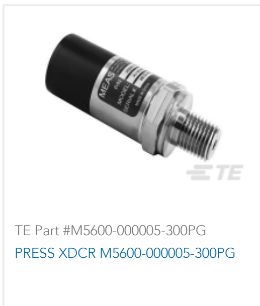
TE Part #M5600-000005-300PG PRESS XDCR M5600-000005-300PG