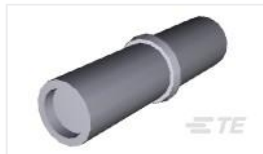
TE Part #1-480349-0 01P CMNL PLUG HSG F/H NATL