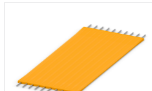
TE Part #2205086-1 FSK-1.5A-5