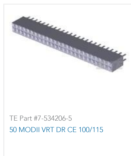
TE Part #7-534206-5 50 MODII VRT DR CE 100/115