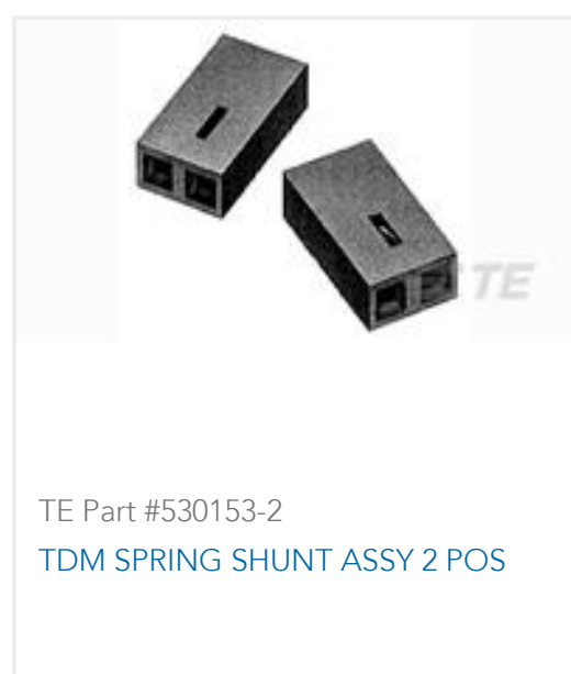
TE Part #530153-2 TDM SPRING SHUNT ASSY 2 POS