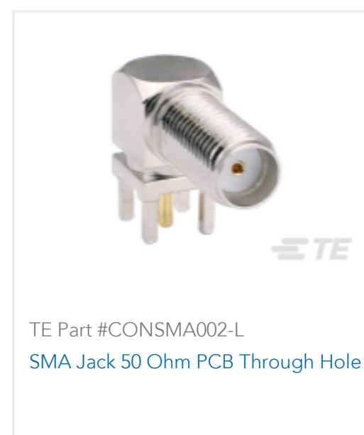
TE Part #CONSMA002-L SMA Jack 50 Ohm PCB Through Hole