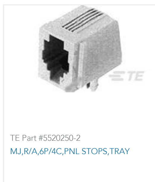
TE Part #5520250-2 MJ,R/A,6P/4C,PNL STOPS,TRAY