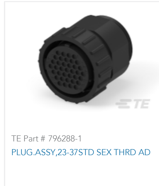
TE Part # 796288-1 PLUG.ASSY,23-37STD SEX THRD AD