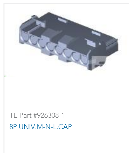
TE Part #926308-1 8P UNIV.M-N-L.CAP