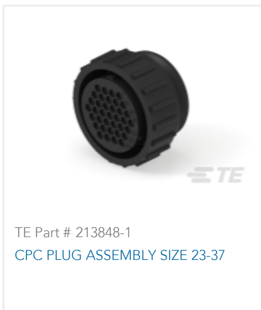
TE Part # 213848-1 CPC PLUG ASSEMBLY SIZE 23-37