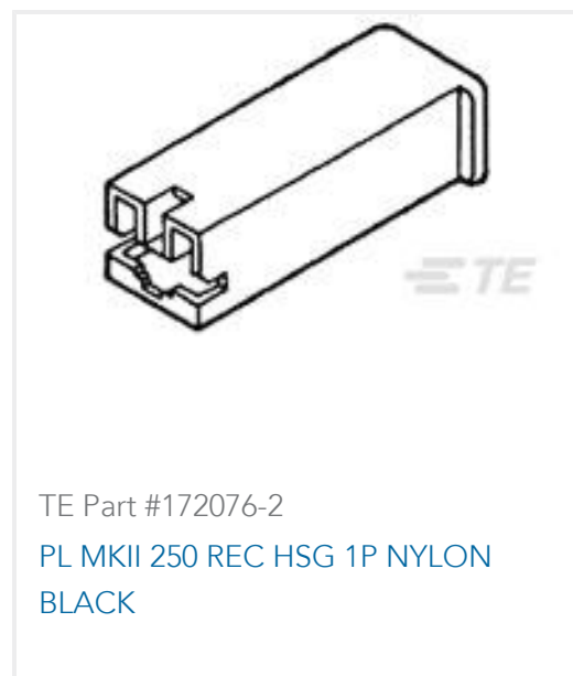
TE Part #172076-2 PL MKII 250 REC HSG 1P NYLON BLACK