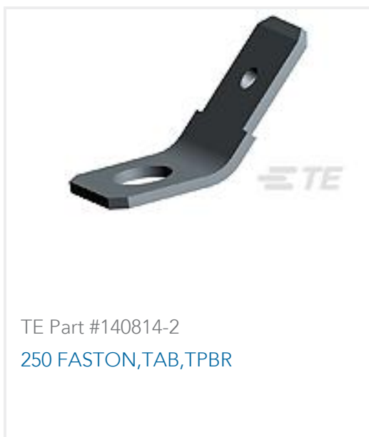
TE Part #140814-2 250 FASTON,TAB,TPBR