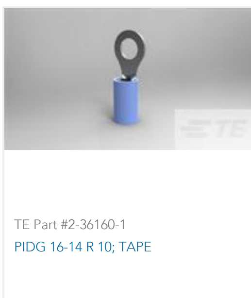
TE Part #2-36160-1 PIDG 16-14 R 10; TAPE