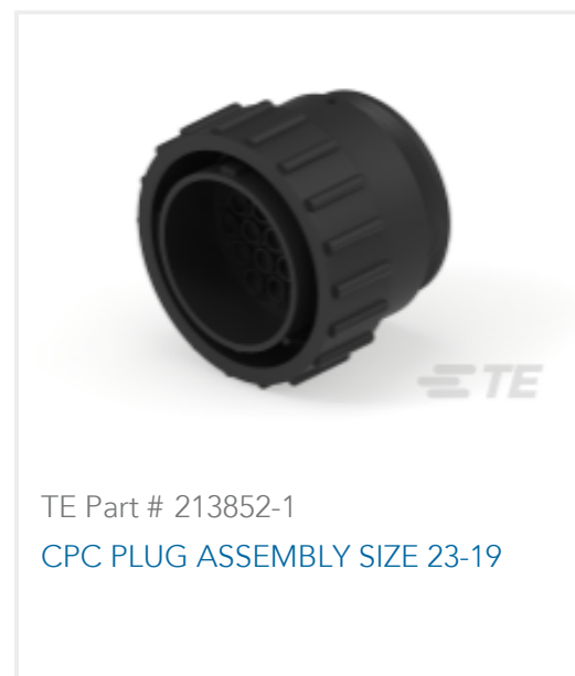
TE Part # 213852-1 CPC PLUG ASSEMBLY SIZE 23-19