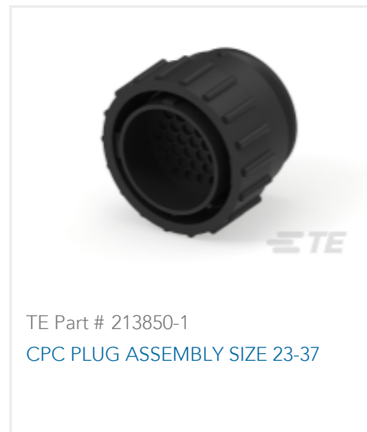
TE Part # 213850-1 CPC PLUG ASSEMBLY SIZE 23-37