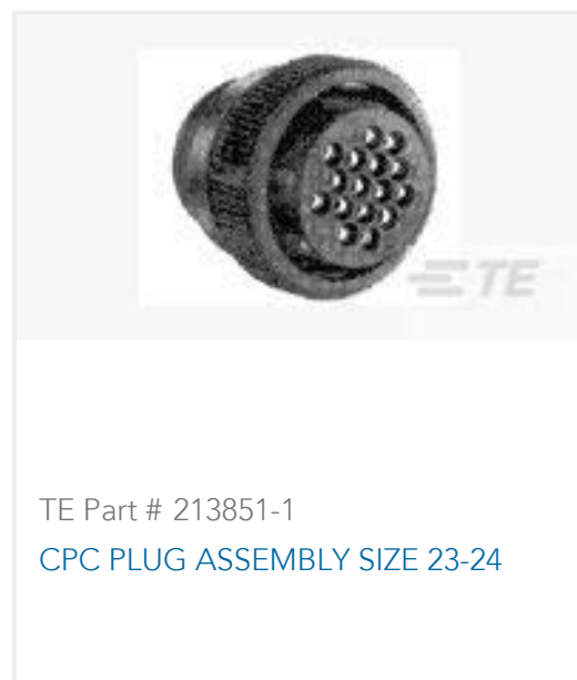
TE Part # 213851-1 CPC PLUG ASSEMBLY SIZE 23-24