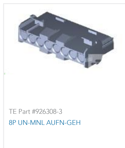
TE Part #926308-3 8P UN-MNL AUFN-GEH