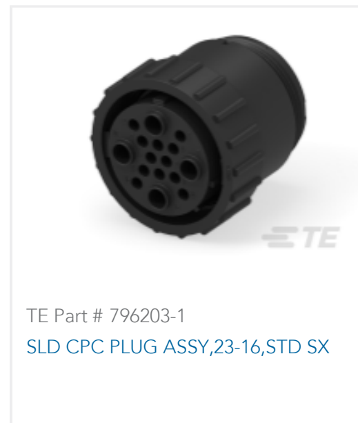
TE Part # 796203-1 SLD CPC PLUG ASSY,23-16,STD SX