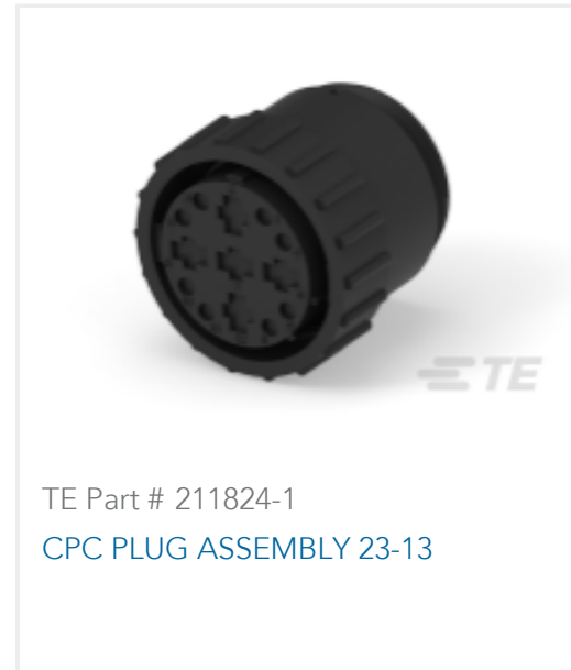
TE Part # 211824-1 CPC PLUG ASSEMBLY 23-13