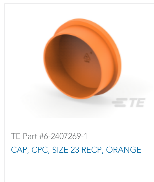
TE Part #6-2407269-1 CAP, CPC, SIZE 23 RECP, ORANGE