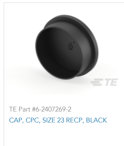
TE Part #6-2407269-2 CAP, CPC, SIZE 23 RECP, BLACK