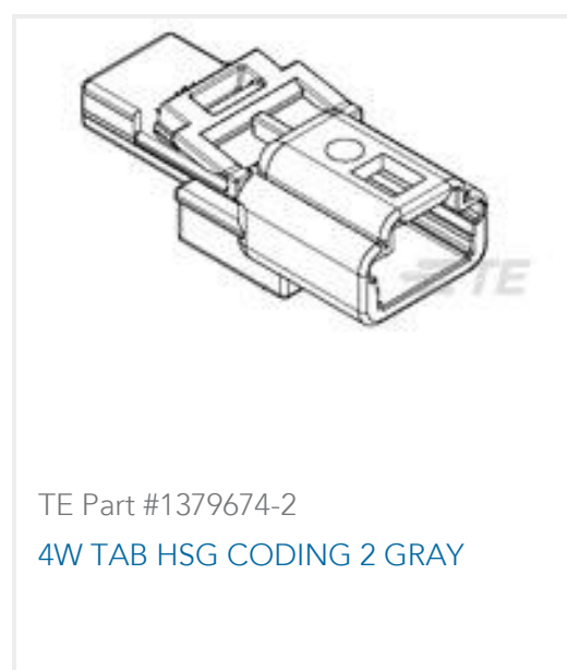
TE Part #1379674-2 4W TAB HSG CODING 2 GRAY