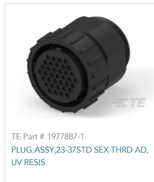
TE Part # 1977887-1 PLUG.ASSY,23-37STD SEX THRD AD, UV RESIS