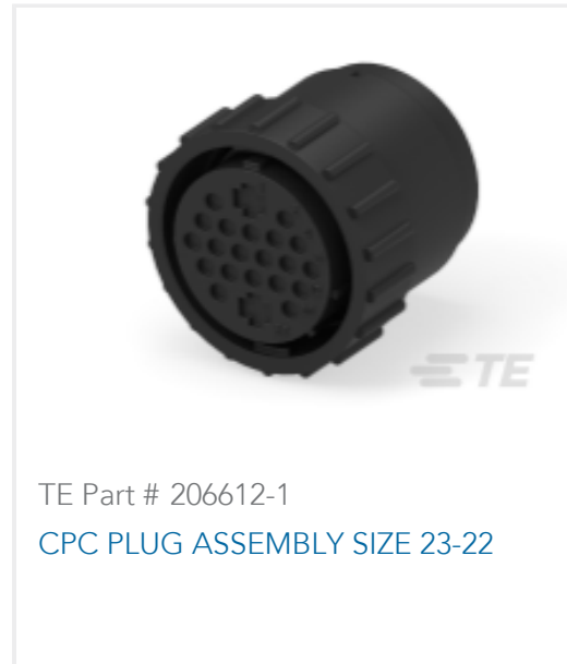
TE Part # 206612-1 CPC PLUG ASSEMBLY SIZE 23-22