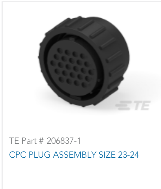
TE Part # 206837-1 CPC PLUG ASSEMBLY SIZE 23-24