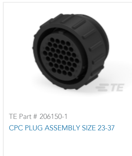
TE Part # 206150-1 CPC PLUG ASSEMBLY SIZE 23-37