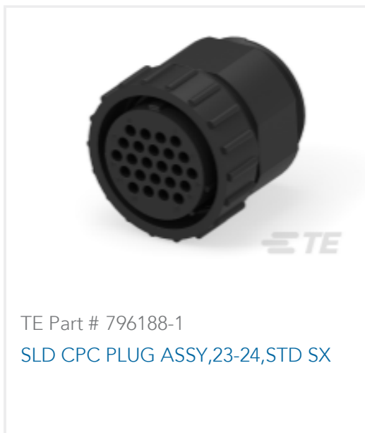
TE Part # 796188-1 SLD CPC PLUG ASSY,23-24,STD SX