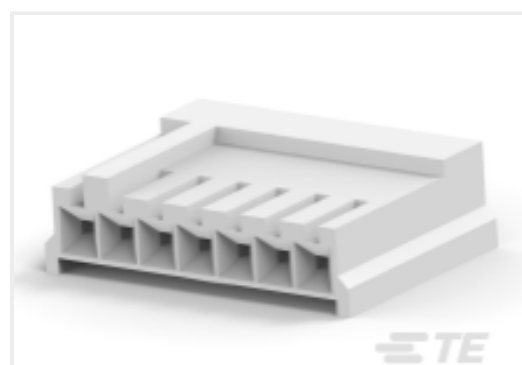
TE Part # 171822-7 EIS REC. HSG 7P-NATURAL