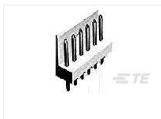
TE Part #171825-9 9P EIS POST HDR VERTICAL