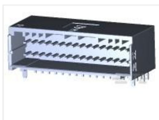
TE Part #1-1939638-7 DYNAMIC 1100D HDR ASSY H 34P XBLACK GOLD