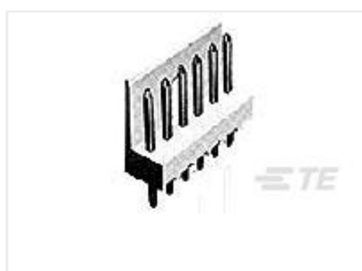
TE Part #1-171825-0 EIS HSG