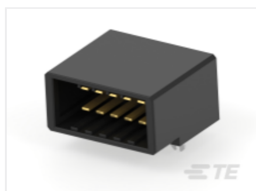
TE Part #178308-3 Header Assembly: Wire-to-Board, 15A, gold or tin plated