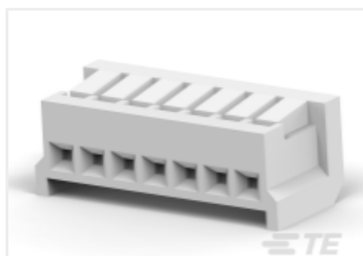
TE Part # 172142-7 EIS LOW PROFILE HSG 7P NATURAL