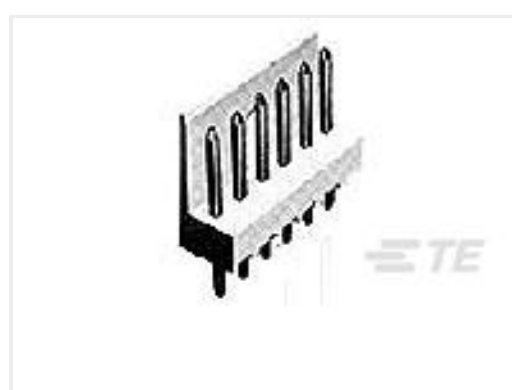
TE Part #171825-8 POST HDR ASSY VERT AMP EI CONN