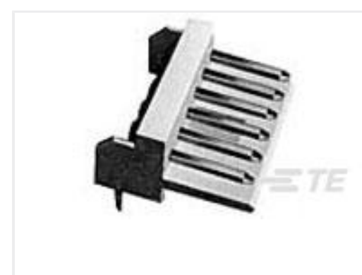
TE Part #171826-3 3P POST HEADER ASSY EI