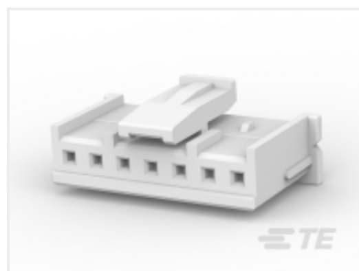
TE Part # 1969442-7 EP 2.5 TPA Housing, 7 Pos