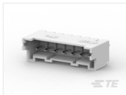
TE Part # 1969730-7 EP2.5 SHROUDED HDR ASSY 7P VERTICAL