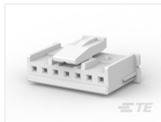
TE Part # 1744417-7 7 POS EP 2.5 HSG, GLOW WIRE VERTICAL