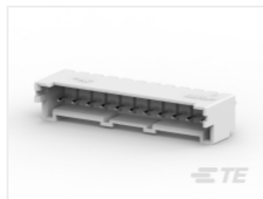
TE Part # 1-1969730-1 EP2.5 SHROUDED HDR ASSY 11P VERTICAL