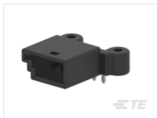
TE Part #174049-2 Signal Header