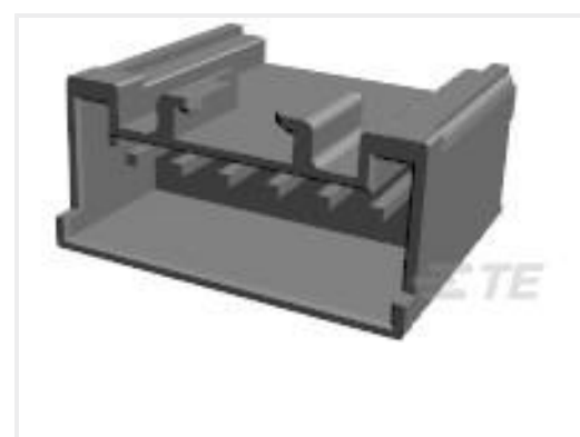
TE Part #917726-1 2.5 S.D.L. P/HDR ASY 6P H/PRO.