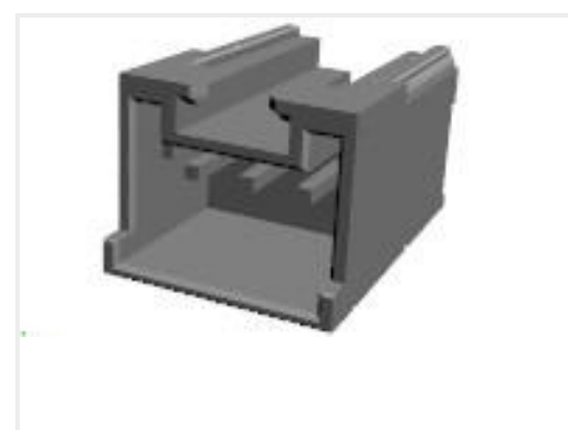
TE Part #917723-1 2.5 SIGNAL D/LOCK HDR ASSY 3P