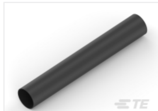
TE Part #NB14902001 DWP-125-3/16-0-STK