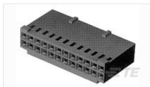
TE Part # 280369 AMPMODU II REC. HSG, DUAL ROW, 44 POS.