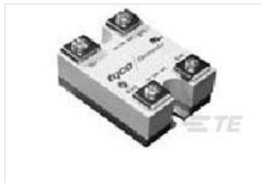
TE Part #1393030-4 SSR-240A25= PANEL MOUNT,25A, 240VAC-AC i/p