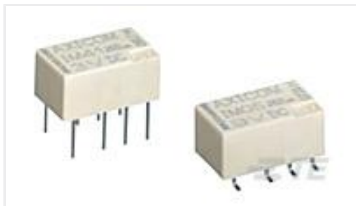
TE Part #1462037-1 IM01GR=IM RELAY 140mW 3V