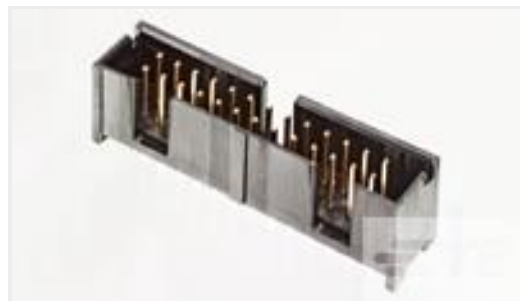
TE Part #5103308-2 A/L LOW PRO HDR 14P VERT BLACK