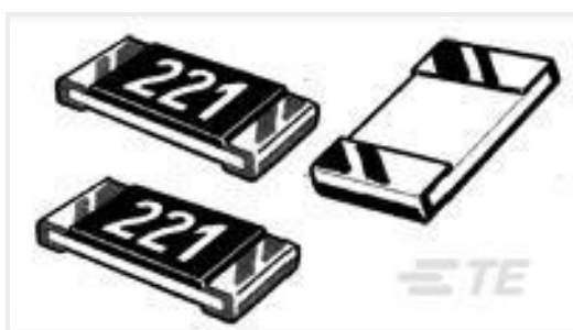
TE Part #5-2176230-6 3522 33K 5% 3W