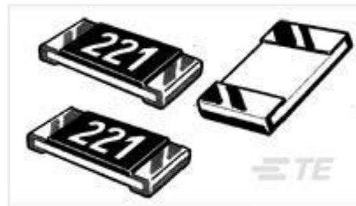
TE Part #3-2176230-3 3522 390R 5% 3W