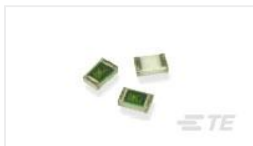
TE Part #4-2176092-3 RP 2A 0.25W 1K96 0.1% 25PPM 1K RL