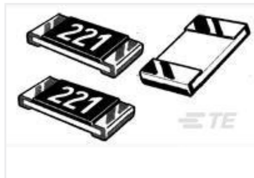
TE Part #1-2176230-4 3522 10R 5% 3W