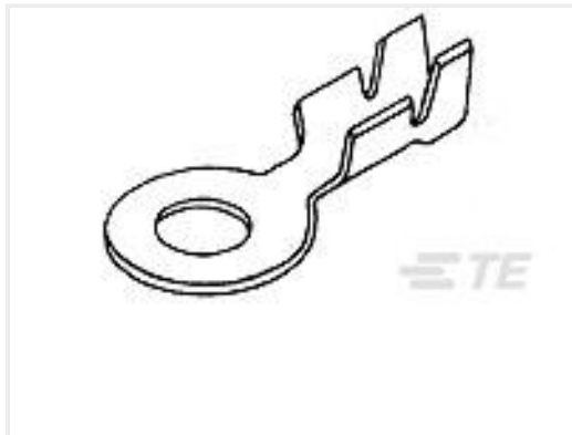
TE Part #62638-1 RING TONGUE 22-20 AWG TPBR