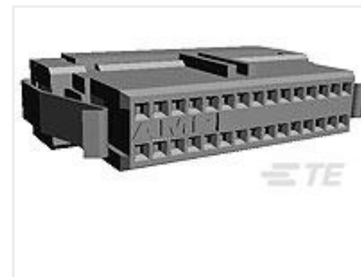
TE Part #2-111196-4 100 RCPT SYSTEM 50, LEAD FREE