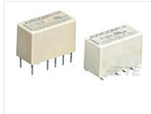
TE Part #5-1393788-5 V23079D1001B301