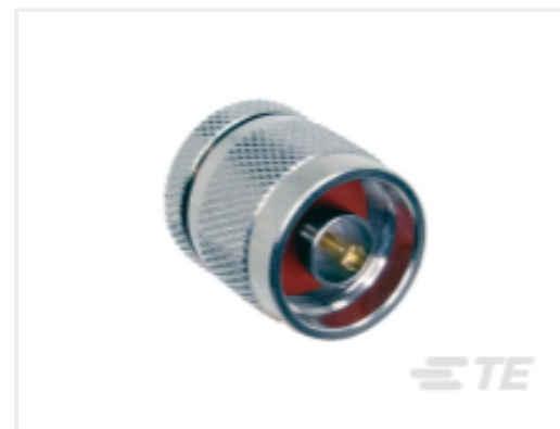
TE Part #ADP-SMAF-NM SMA Jack to N Type Plug