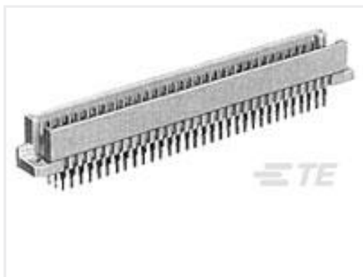
TE Part #650889-5 096 EURO TYPE R PIN AP ASSY