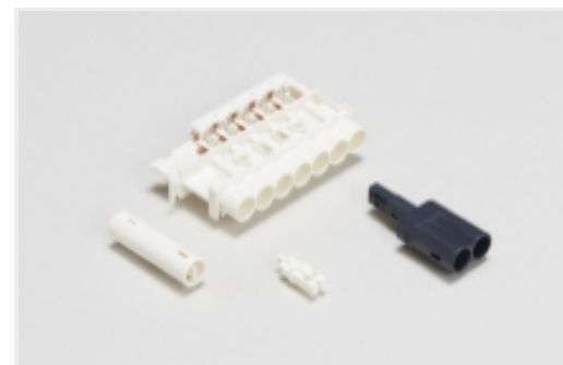
Plug & Socket Lighting Connectors(30)