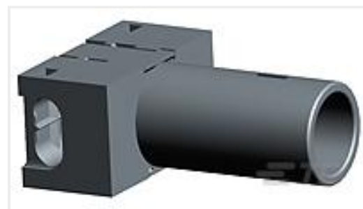
TE Part #1-2213222-1 NECTOR S BUS BAR SEALED US, THRU HV-3