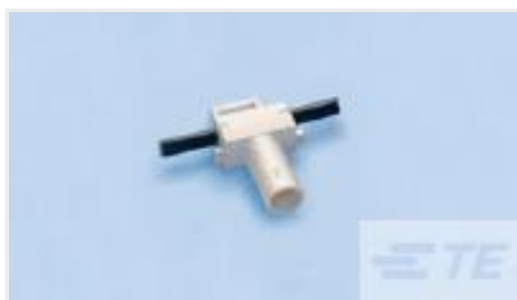
TE Part #293270-3 NECTOR S BUS BAR SEALED CONN HV-1