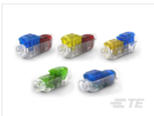
TE Part #2213600-2 CoolSplice Quick Connect Splice