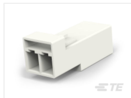
TE Part #2834049-1 REC, 2P LATCHED POKE-IN WTW CONN.NL