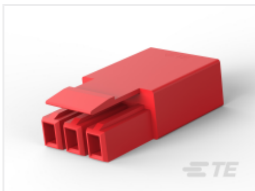
TE Part # 2834054-4 PLUG, 3P LATCHED POKE-IN WTW CONN.RD