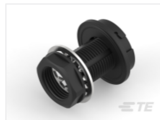
TE Part #2213858-1 RECEPTACLE ASSEM., LUMAWISE ENDURANCE S