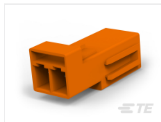
TE Part #1-2834049-3 REC MOD, 2P LATCHED POKE-IN WTW CONN.OR