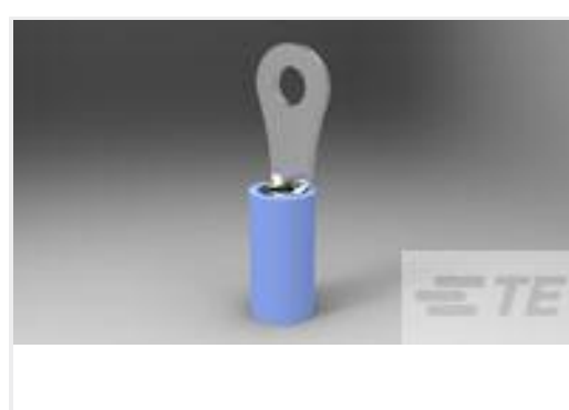
TE Part #2-324159-2 TERMINAL,PIDG R 16-14 4