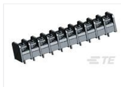
TE Part #4-1437664-4 NC6-P108-10=NC6 ASSEMBLY