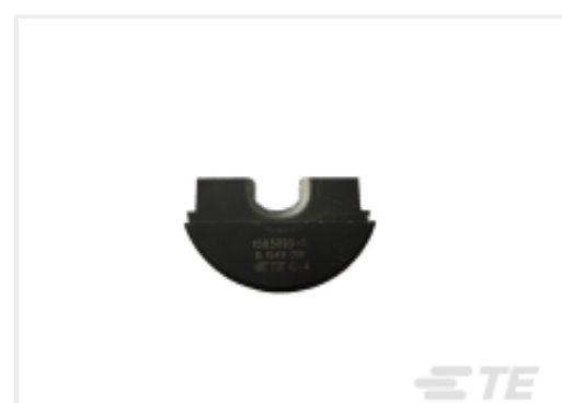
TE Part # 1-1490413-9 NEST, 90 DEG SOLISTRAND, 2/0