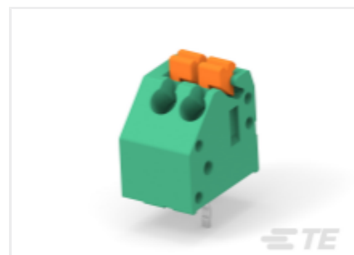
TE Part #1-2834011-2 2POS 3.5MM TOP ENTRY SCREWLESS CONN.