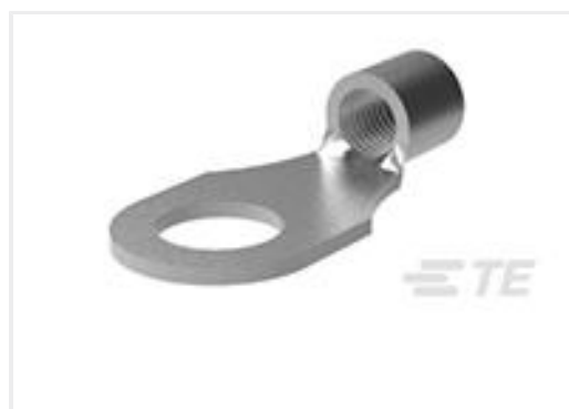
TE Part #322870-1 TERMINAL,SOLIS R 2 5/16 90DEG