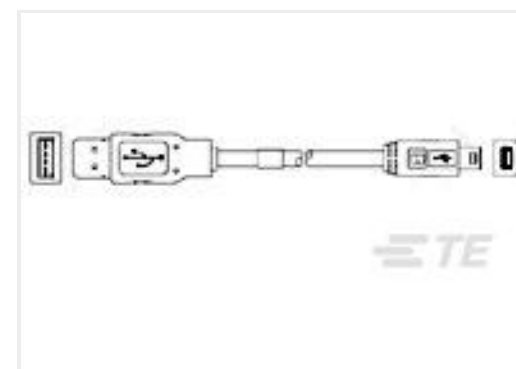
TE Part #1487586-3 USB, A-B, 28/28, WHITE, 0.16M