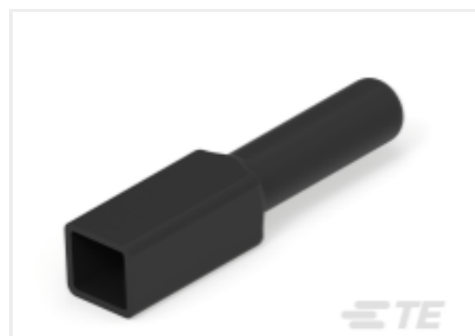
TE Part #DT2P-BT-BK BOOT, 2P, REC, ST, BLK