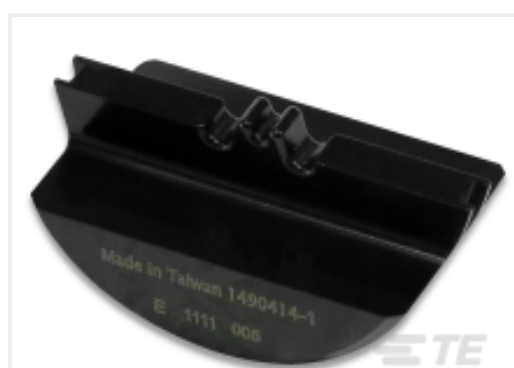
TE Part # 1490414-1 HYP10 SOLIS 8AWG INDENTER