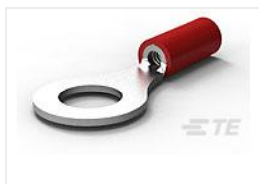
TE Part #696049-1 PG 8 RING #8