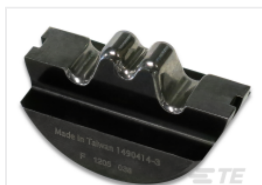
TE Part # 1490414-3 HYP10 SOLIS HD 1/0AWG INDENTER