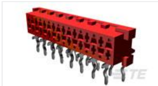
TE Part #2-215460-0 MICRO-MATCH FEM.SE