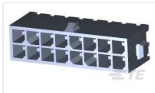
TE Part #4-794632-6 16P MICRO MNL ASSY,VRT,HDR,LF