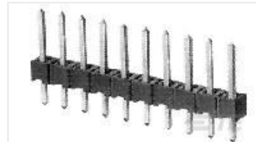
TE Part #826926-8 AMPMODU II HDR R/A DBL RW UNSHR