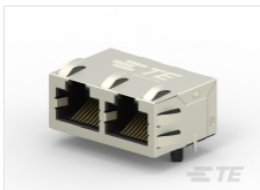
TE Part #2301996-1 RJ45 JACK INT.MAG. 10/100 1X2 INV.