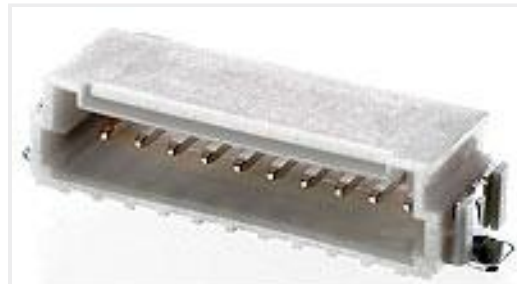
TE Part #292227-3 1.5 MINI CT SGL H SMT W BOSS 3