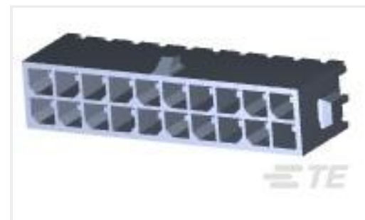
TE Part #5-794632-0 20P MICRO MNL ASSY,VRT,HDR,LF