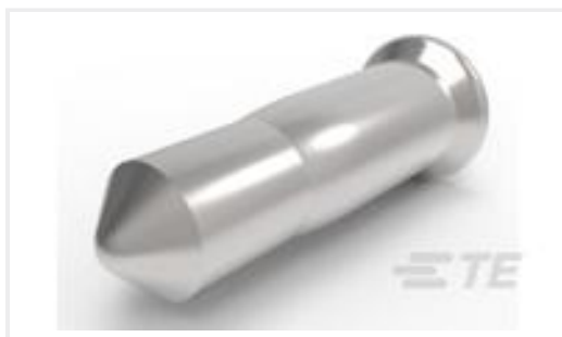
TE Part #1-5645956-1 SOCKET,MIN-SPR B-N SN-SN SER-2