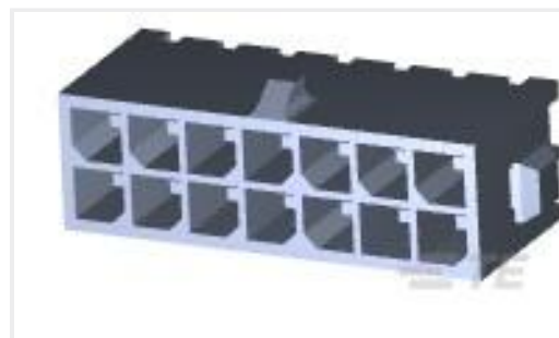
TE Part #4-794632-4 14P MICRO MNL ASSY,VRT,HDR,LF