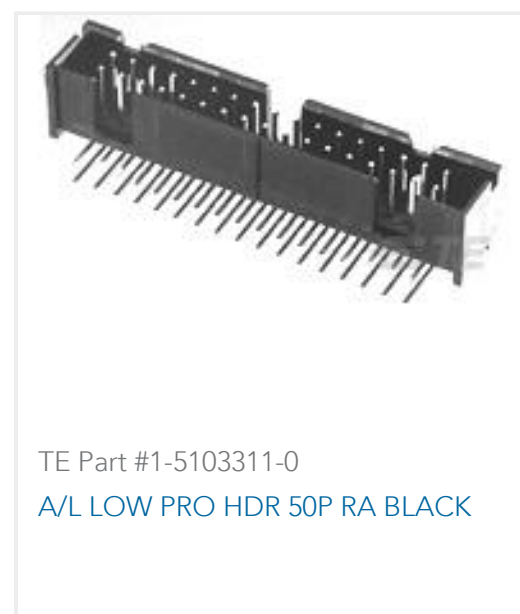
TE Part #1-5103311-0 A/L LOW PRO HDR 50P RA BLACK