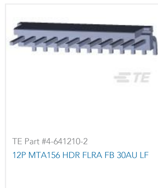
TE Part #4-641210-2 12P MTA156 HDR FLRA FB 30AU LF