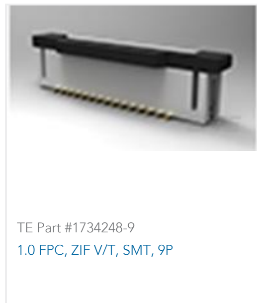
TE Part #1734248-9 1.0 FPC, ZIF V/T, SMT, 9P