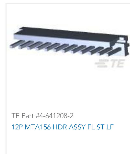
TE Part #4-641208-2 12P MTA156 HDR ASSY FL ST LF