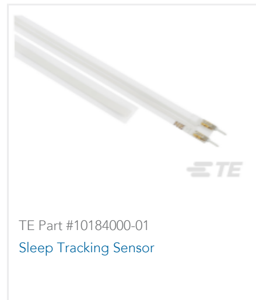
TE Part #10184000-01 Sleep Tracking Sensor