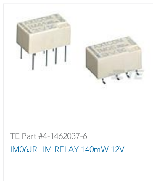
TE Part #4-1462037-6 IM06JR=IM RELAY 140mW 12V