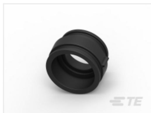
TE Part #2428-008-2405 BKSHL, 24SZ, BLK, ST, NW 25.4, L017, HDP