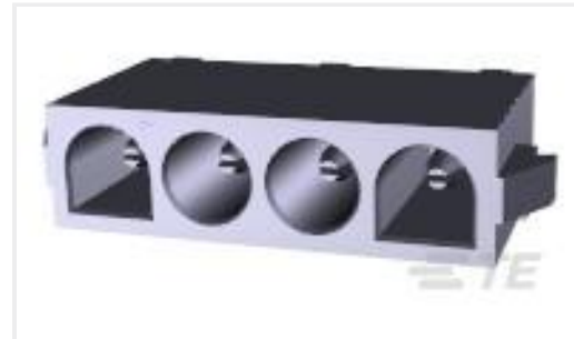
TE Part #350584-4 04P UMNL PIN HDR ASSY V2 LF