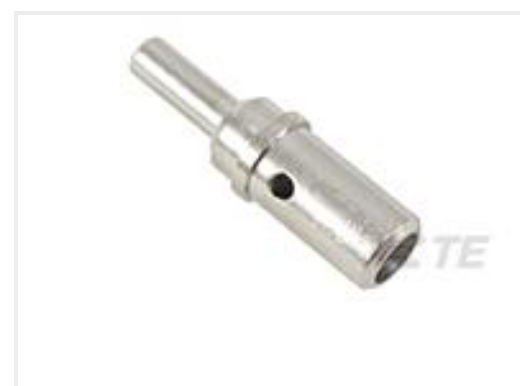
TE Part #0460-204-08141 PIN, SOLID, SIZE 8, 8-10AWG, NI