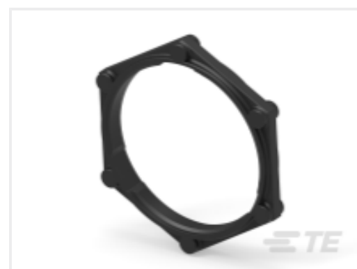
TE Part #2411-001-2405 PANEL NUT, SIZE 24, HDP