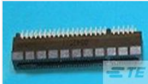
TE Part #5645235-3 CONN SEC II 50 POS 100C/L