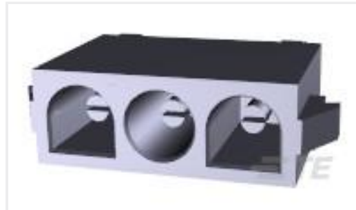
TE Part #350583-4 03P UMNL PIN HDR ASSY V2 LF