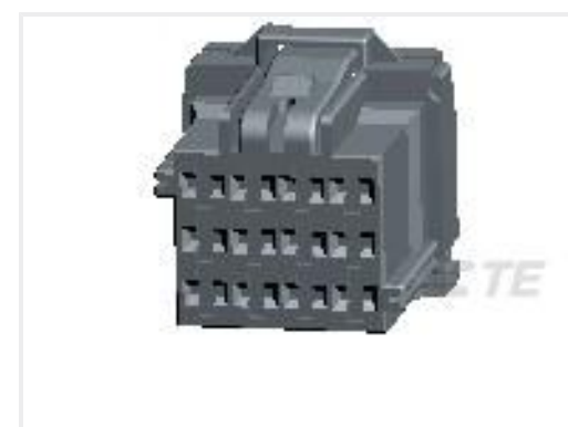
TE Part #8-968972-1 MCP 2.8 GEH 12P