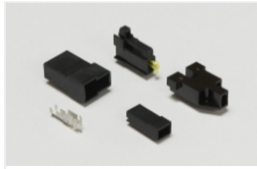
Magnet Wire Terminals(192)