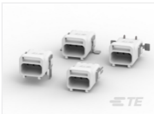
TE Part # CAT-SL36-M6642B Miniature Headers, SlimSeal