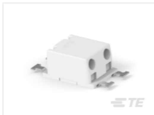
TE Part # 2834334-2 4.0PITCH ITB CONN_2P_W CAP_NATURAL