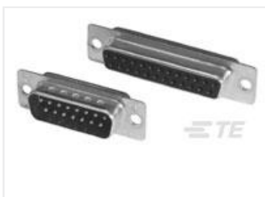
TE Part #5-747908-2 15 Plug Solder Cup, Gold Flash