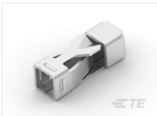
TE Part # 2834167-3 RELEASABLE SLIM CONTACT