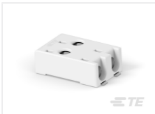
TE Part # 2834385-2 RELEASE POKE-IN CONNECTOR_2P_NATURAL