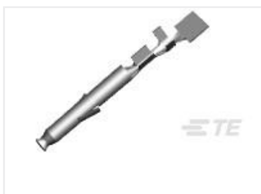
TE Part #794058-1 MINI UMNL SOK L/P