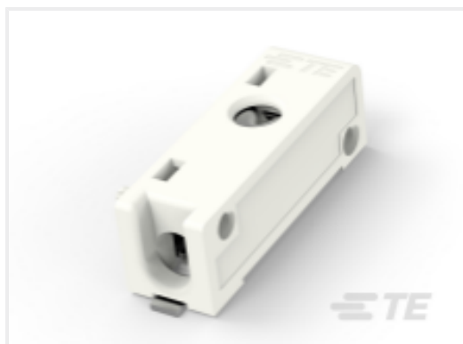
TE Part # 2834006-1 RELEASE POKE-IN CONNECTOR_1POLES