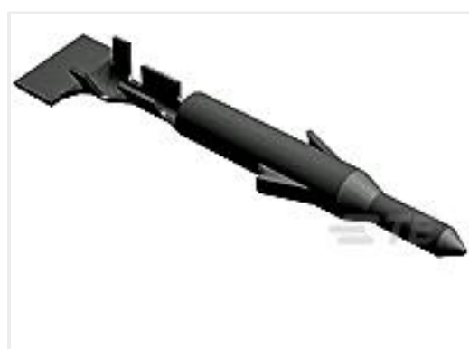
TE Part #794059-1 MINI UMNL PIN L/P