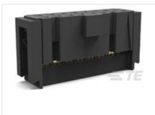
TE Part #1658527-3 622-1030LF FEM SOCKET, LEAD FREE