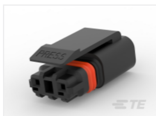
TE Part #2-2834074-2 SlimSeal Miniature Plugs