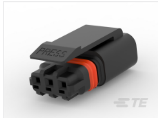
TE Part # 2-2834074-3 3P PLUG, MINIATURE WATERPROOF CONN, BLACK