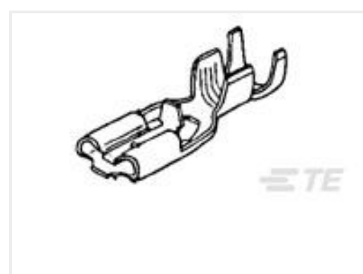
TE Part #170332-1 PL 187 RECEPTACLE 18-14 AWG PTPBR