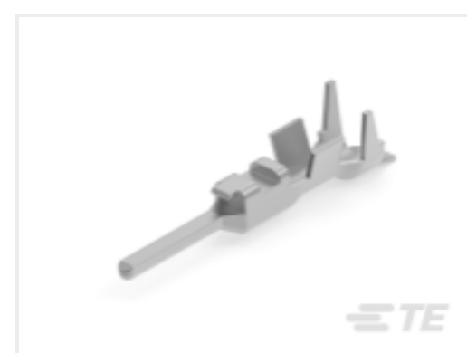
TE Part #2-2834068-2 PIN CONTACT, MINIATURE WATERPROOF CONN