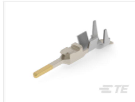
TE Part # 1-2834068-3 PIN CONTACT, MINIATURE WATERPROOF CONN