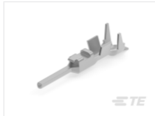
TE Part # 1-2834068-2 PIN CONTACT, MINIATURE WATERPROOF CONN