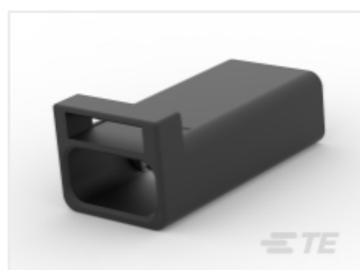
TE Part #1-2834075-3 SlimSeal Miniature Receptacles