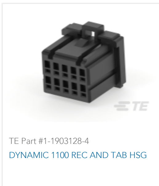
TE Part #1-1903128-4 DYNAMIC 1100 REC AND TAB HSG