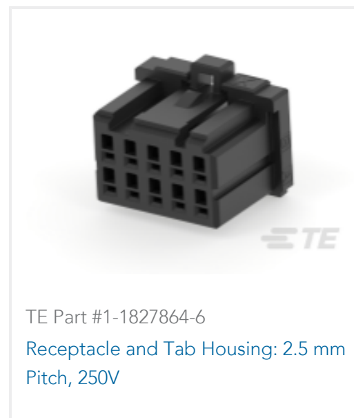
TE Part #1-1827864-6 Receptacle and Tab Housing: 2.5 mm Pitch, 250V