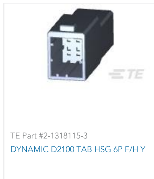
TE Part #2-1318115-3 DYNAMIC D2100 TAB HSG 6P F/H Y