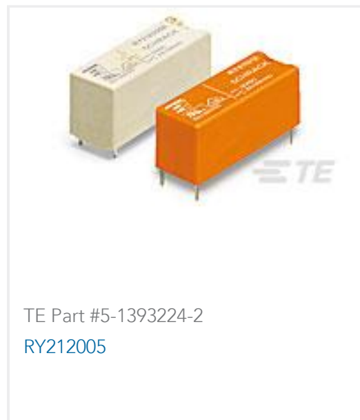
TE Part #5-1393224-2 RY212005