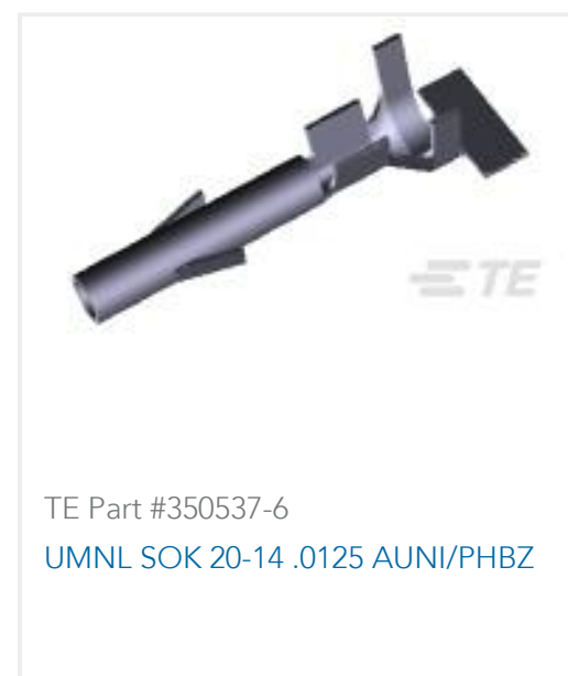
TE Part #350537-6 UMNL SOK 20-14 .0125 AUNI/PHBZ