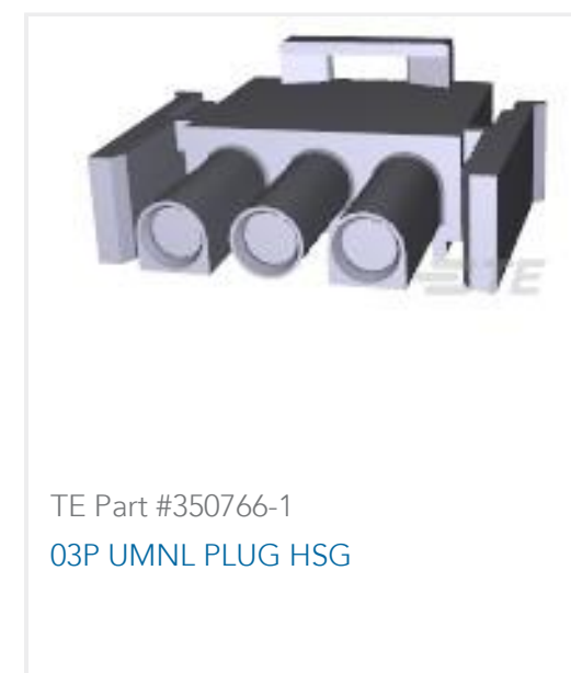
TE Part #350766-1 03P UMNL PLUG HSG