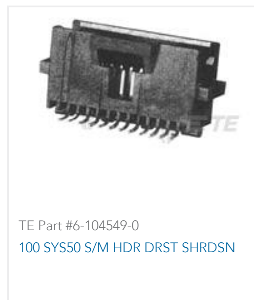
TE Part #6-104549-0 100 SYS50 S/M HDR DRST SHRDSN