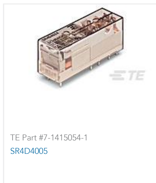
TE Part #7-1415054-1 SR4D4005