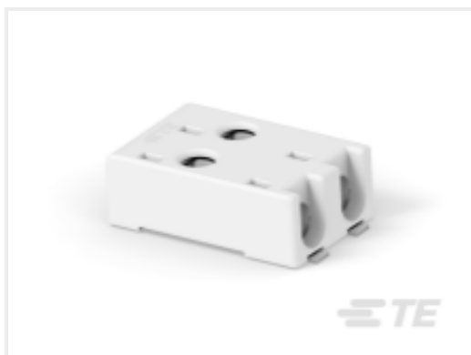
TE Part # 2834385-2 RELEASE POKE-IN CONNECTOR_2P_NATURAL