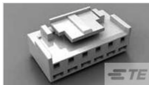
TE Part #1-1123722-3 3.96 EP PLUG HSG 3P(NATURAL)