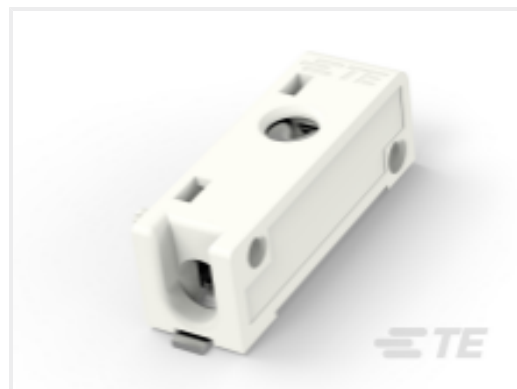
TE Part # 2834006-1 RELEASE POKE-IN CONNECTOR_1POLES