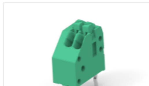
TE Part #1-2834021-2 2POS 2.5MM TES CONN.