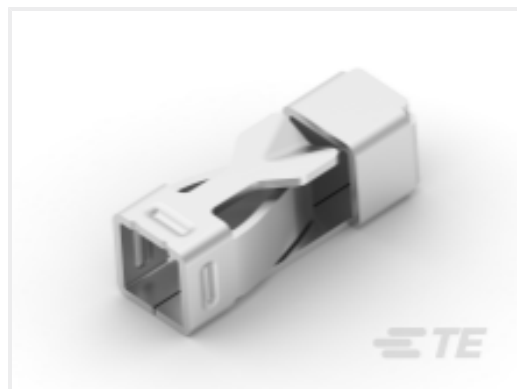
TE Part # 2834167-3 RELEASABLE SLIM CONTACT