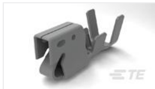
TE Part #1744201-1 EP-II CONTACT LANCELESS, 20-16