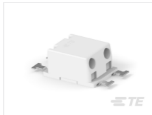
TE Part # 2834334-2 4.0PITCH ITB CONN_2P_W CAP_NATURAL