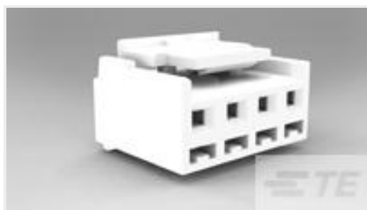
TE Part #2132781-3 03P EP-II HOUSING, NATURAL