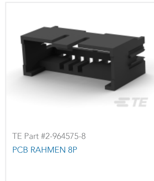
TE Part #2-964575-8 PCB RAHMEN 8P