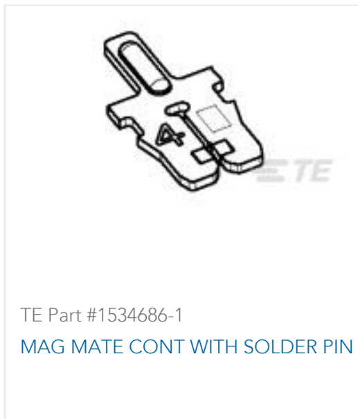
TE Part #1534686-1 MAG MATE CONT WITH SOLDER PIN