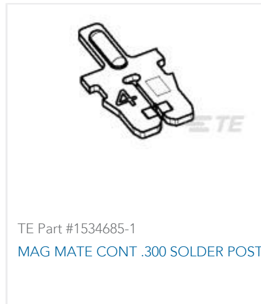
TE Part #1534685-1 MAG MATE CONT .300 SOLDER POST