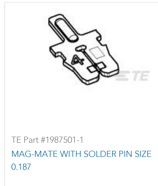
TE Part #1987501-1 MAG-MATE WITH SOLDER PIN SIZE 0.187