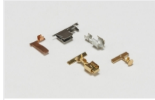
Special Purpose Terminals(1)