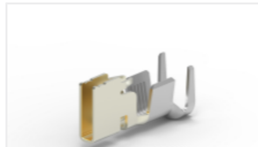
TE Part #1-1600960-8 CONT 8-10 AWG PWR, STD PLATE & MOUNT