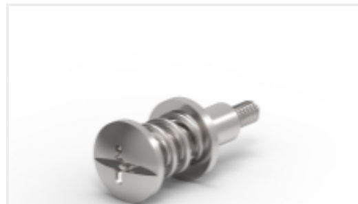
TE Part #1600914-1 HARDWARE KIT MBXL, PANEL MOUNT