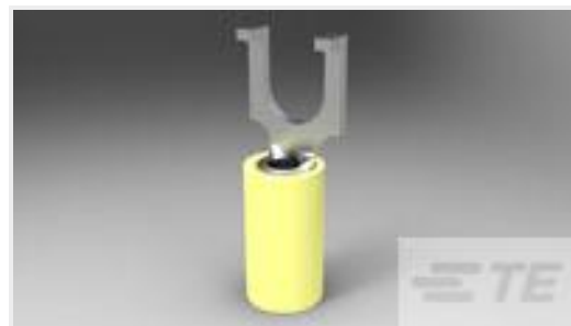
TE Part #326865 TERMINAL,PIDG SPD FLG 12-10 10