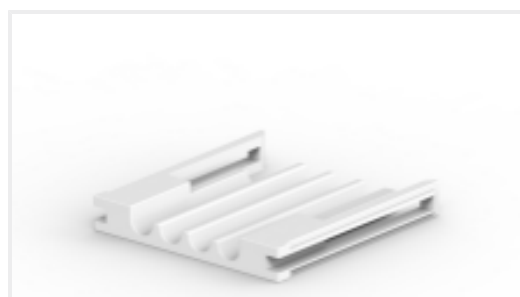
TE Part #1600902-1 INSERT MBXL 2 SIGNAL LOCK 4POS