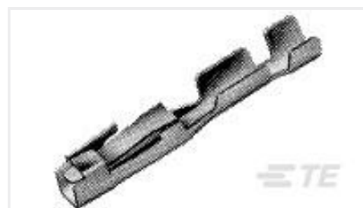
TE Part #5531216-5 CONTACT MINI TANDEM SPRING L