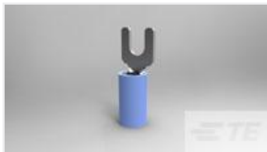
TE Part #2-35559-1 TERMINAL,PIDG SPD 16-14 6