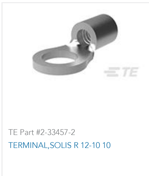
TE Part #2-33457-2 TERMINAL,SOLIS R 12-10 10