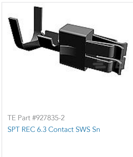
TE Part #927835-2 SPT REC 6.3 Contact SWS Sn