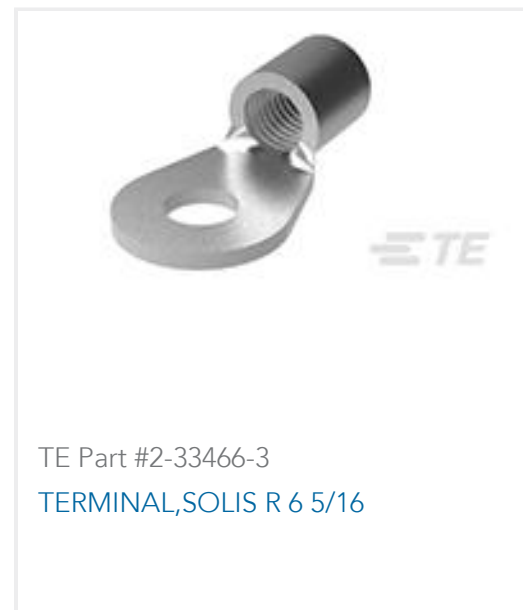
TE Part #2-33466-3 TERMINAL,SOLIS R 6 5/16