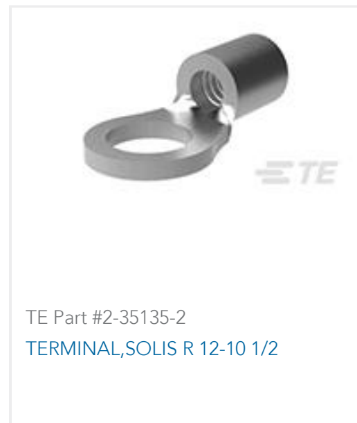
TE Part #2-35135-2 TERMINAL,SOLIS R 12-10 1/2