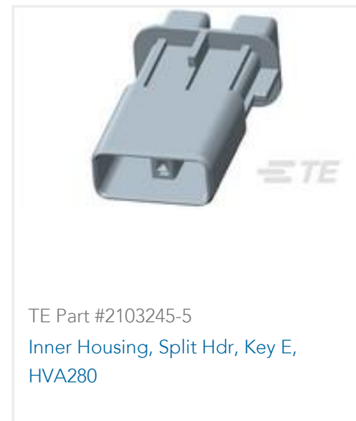
TE Part #2103245-5 Inner Housing, Split Hdr, Key E, HVA280