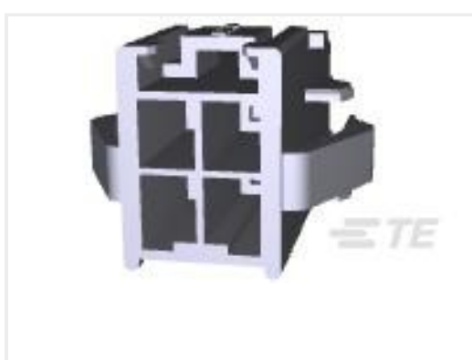
TE Part #177908-1 POWER DBL LOCK CAP HSG P/M 4P