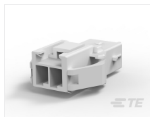
TE Part # 2005249-1 PDL 2P CAP 3.96 P/M(GWT) NAT