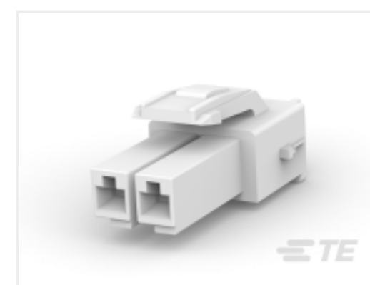
TE Part # 5-177898-1 POWER DBL LOCK PLUG HSG 2P (GWT)