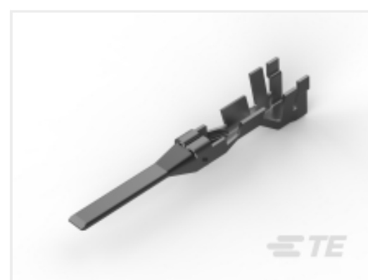
TE Part # CAT-P87024-T111 Power Double Lock Tab