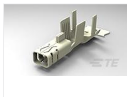
TE Part #1971787-2 PTL RECEPTACLE CONTACT, 2X18 AWG