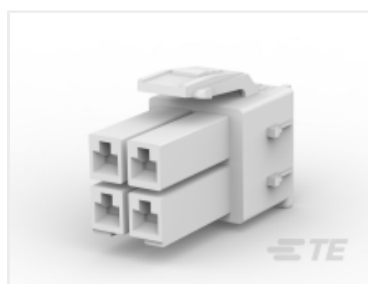
TE Part # CAT-P87024-P729 STD Temp Power Double Lock Plug