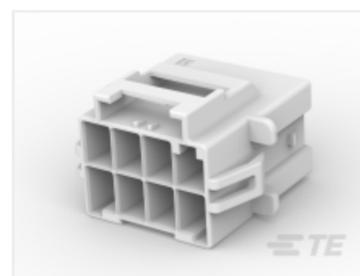
TE Part #1-1971772-4 Standard Temperature Caps | POWER TRIPLE LOCK