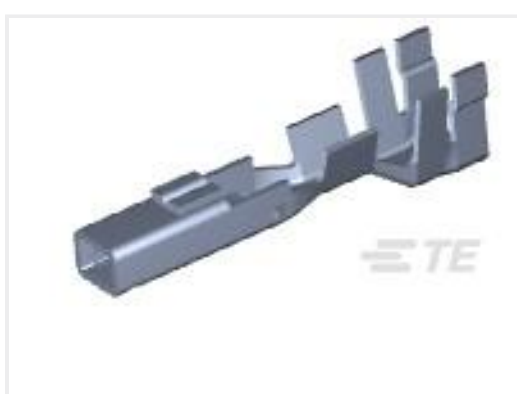
TE Part #177914-1 AMP POWER DBL LOCK REC (S)