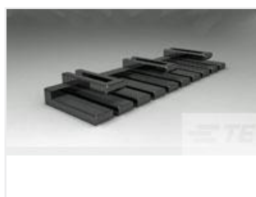
TE Part #1-1969443-0 EP 2.5 TPA Retainer, 10 Pos