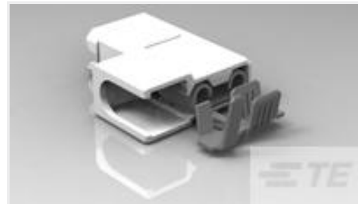
TE Part #521282-2 ULTRA-POD 250 ASSY REC 18-14 AWG TPBR