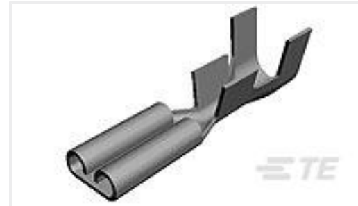
TE Part #5-160430-7 187 FASTON REC 20-16 AWG TPBR