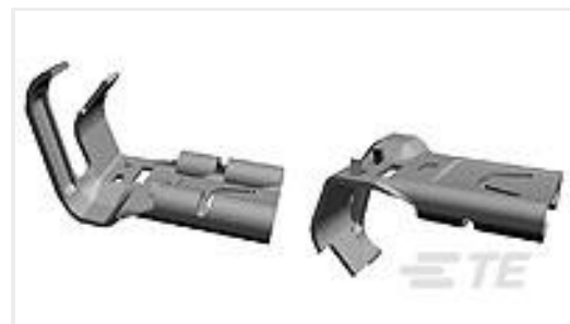
TE Part #63445-4 250 FASTON FLAG REC 18-12 AWG TPBR