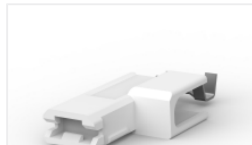
TE Part #521600-2 ULTRA POD: Flag, Receptacle Assembly, Tin Plated, .187 inch