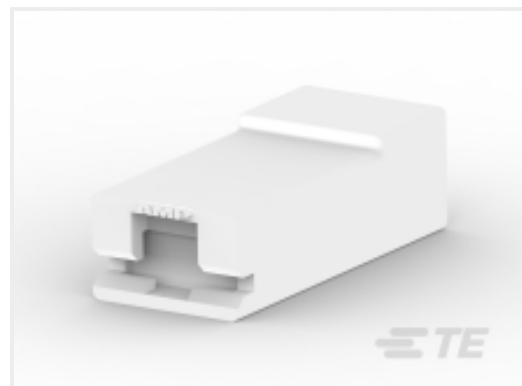
TE Part #2-480416-5 250 FASTON HSG., REC., 1 POS, NATURAL