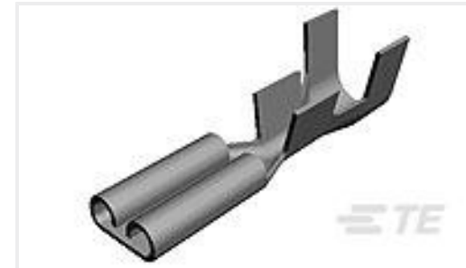
TE Part #41728 250 FASTON REC 16-12 AWG TPBR