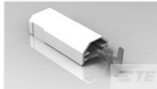
TE Part #521217-2 ULTRA-POD 250 ASSY TAB 18-14 AWG TPBR