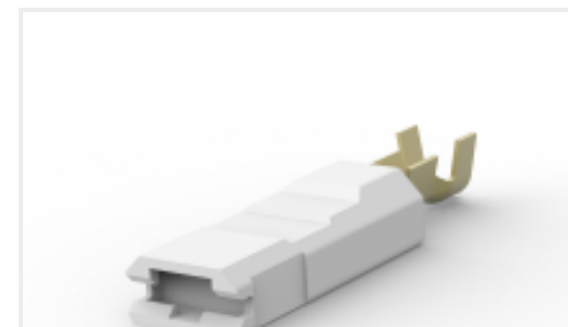
TE Part #1-1969529-1 ULTRA-POD 250 ASSEMBLY REC 18- 14 AWG BR