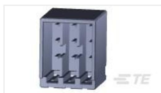
TE Part #1-1827581-3 DYNAMIC 1500T HDR ASSY V 9P X BLACK GOLD