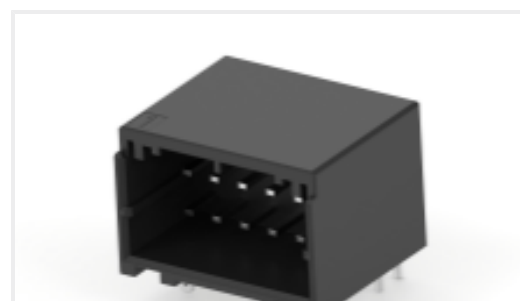
TE Part #1-1827876-0 Header Assembly: Wire-to-Board, 5A, gold or tin plated