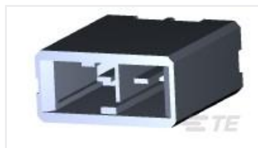
TE Part #1-917337-2 DYNAMIC D-3 VERTI. HDR ASSY 2P