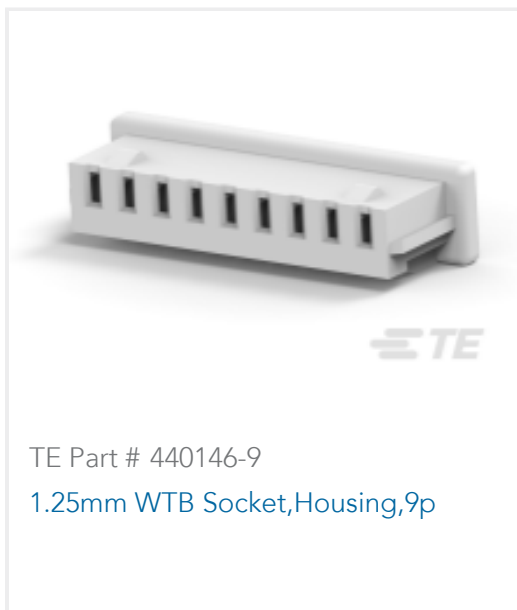
TE Part # 440146-9 1.25mm WTB Socket, Housing, 9p