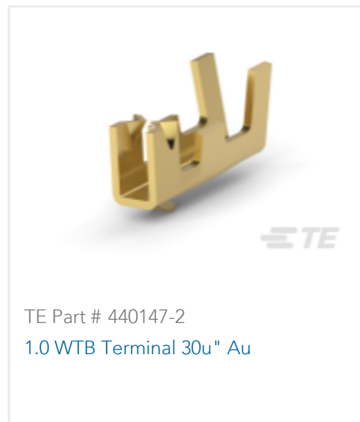
TE Part # 440147-2 1.0 WTB Terminal 30u" Au