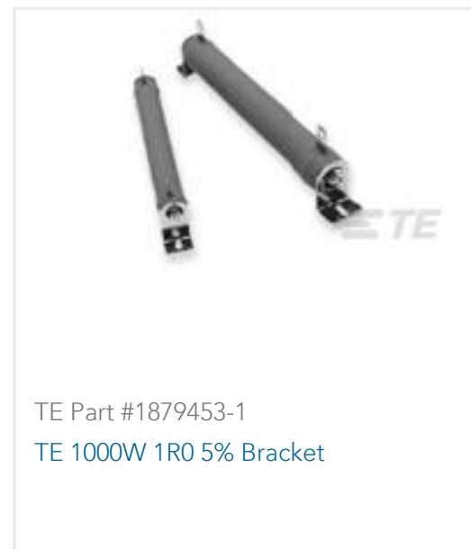
TE Part #1879453-1 TE 1000W 1R0 5% Bracket