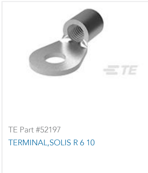
TE Part #52197 TERMINAL, SOLIS R 6 10