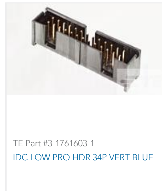
TE Part #3-1761603-1 IDC LOW PRO HDR 34P VERT BLUE