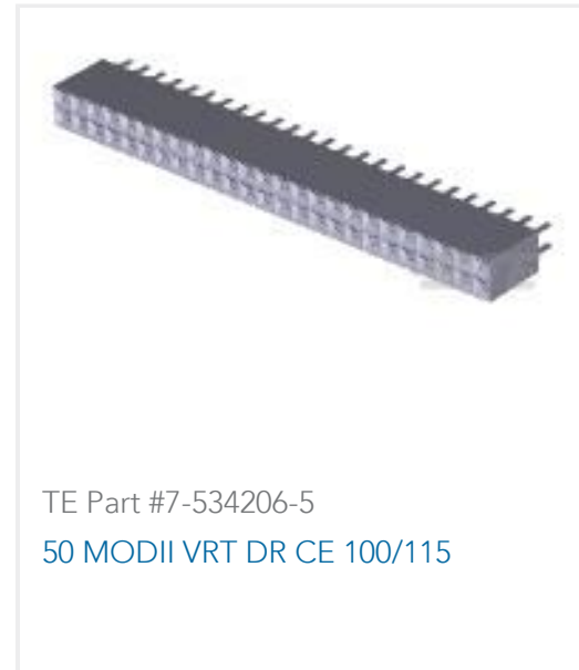
TE Part #7-534206-5 50 MODII VRT DR CE 100/115