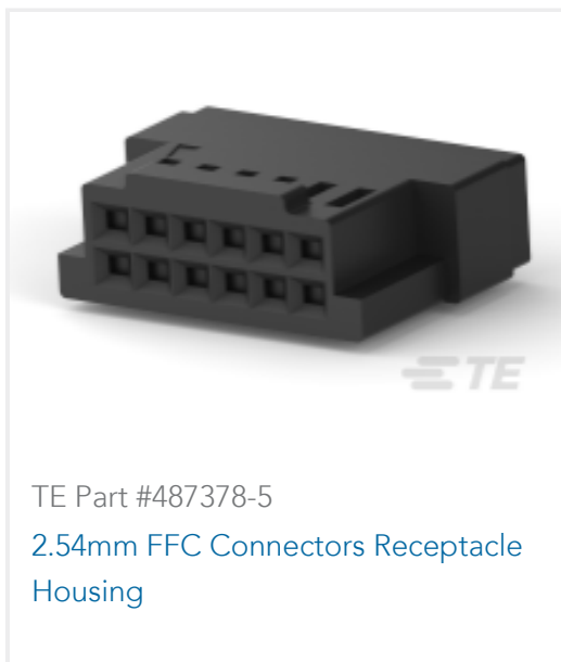
TE Part #487378-5 2.54mm FFC Connectors Receptacle Housing