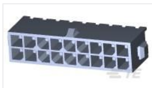
TE Part #4-794632-8 18P MICRO MNL ASSY,VRT,HDR,LF