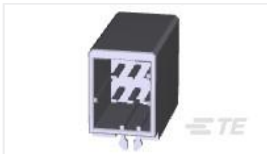
TE Part #1376136-1 DYNAMIC D2100 HDR H ASSY 6P X