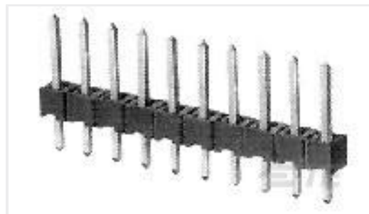
TE Part #826646-3 3P AMPMODU II STIFT LEI