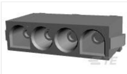
TE Part #350761-5 04P UMNL HDR ASSY PC LF