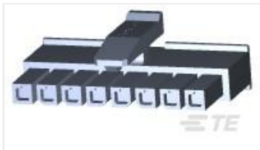
TE Part #1445022-8 MICRO MNL RFECEPT HSG SINGLE R