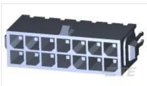
TE Part #4-794682-4 14P MICRO MNL ASSY,VRT,THRU,LF