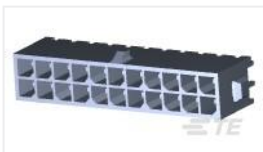
TE Part #5-794632-2 22P MICRO MNL ASSY,VRT,HDR,LF