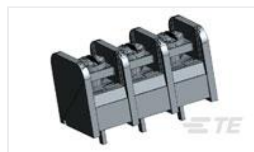
TE Part #3-1437664-1 NC6-P108-03=NC6 ASSEMBLY