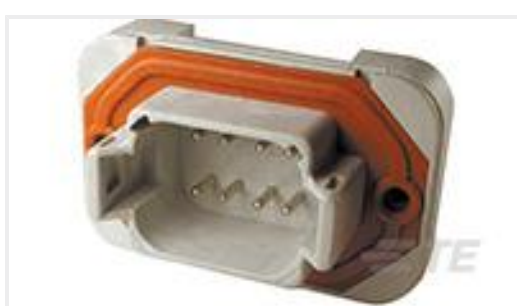
TE Part #DT15-08PA HDR, 8P, GRY, ST, NI/CU, A