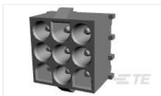
TE Part #350432-1 09P UMNL PIN HDR ASSY NATL