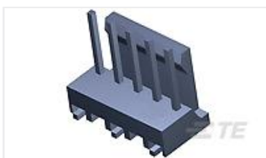
TE Part #3-647502-3 03P MTA100 HDR ASSY, SM, SN, LF