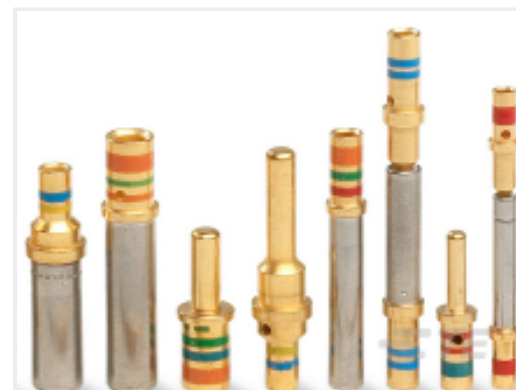
TE Part #0662-207-1631L CONT SOC ASSY