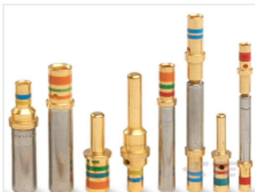
TE Part #100504L CONT SOC ASSY