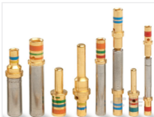
TE Part # 4162-201-1631L CONT SOC ASSY