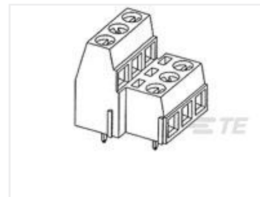
TE Part #1-796692-0 TERMI-BLOK PCB MOUNT 1&2 10P.5