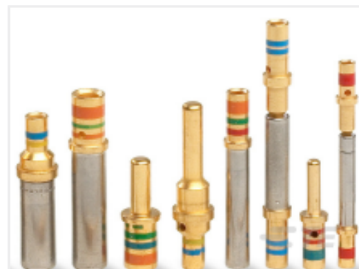
TE Part #0641-1-2031L CONT PIN