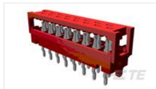
TE Part #215570-4 MICRO-MATCH PBC.04P