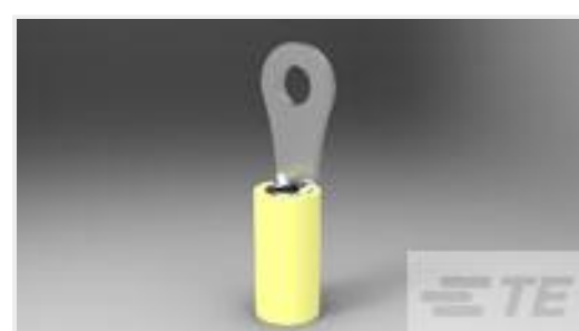
TE Part #323914 TERMINAL,PIDG R 26-22 4