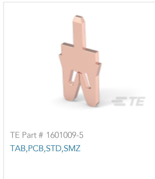
TE Part # 1601009-5 TAB,PCB,STD,SMZ