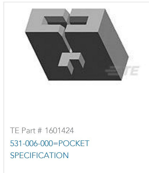
TE Part # 1601424 531-006-000=POCKET SPECIFICATION