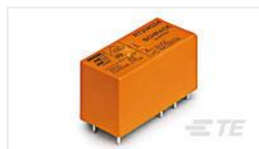
TE Part #1393240-1 RT314048