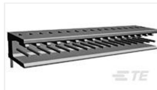
TE Part #826468-4 4P MOD II SHROUDED HEADER, RT ANG.