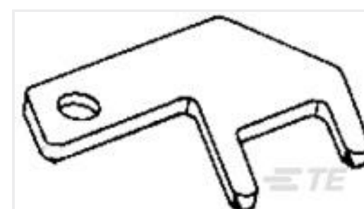
TE Part #725996-2 110 FASTON TAB TPBR