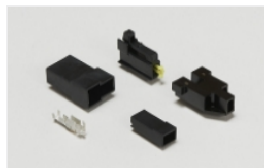
Magnet Wire Terminals(192)