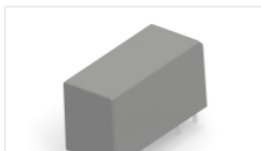
TE Part #2071452-9 RZ0H-1A4-D012-R0001 (TES)