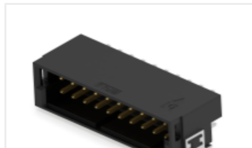
TE Part #374317-E DRCB 2,54 20 M SMD * 137 E012 094 GURT *