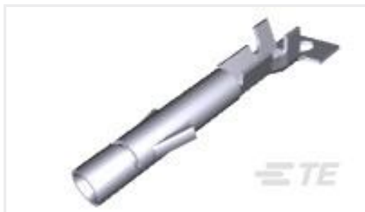
TE Part #926895-3 UNIVERSAL M-N-L SOCKET