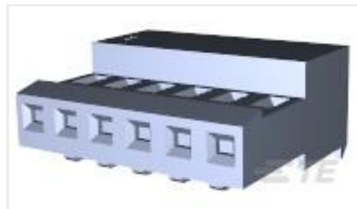
TE Part #3-640443-6 06P MTA100 CONN ASSY GRN