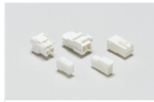
Rectangular Power Connectors(98)