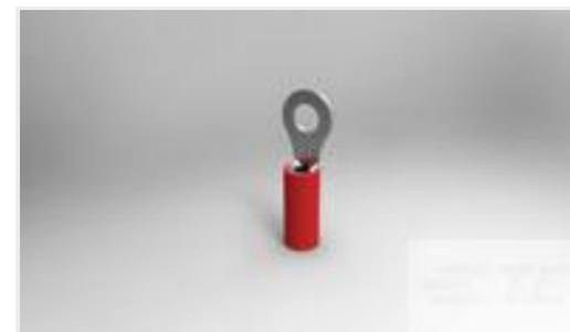
TE Part #8-36152-1 PIDG R 22-16 COMM 22-18 MIL 6