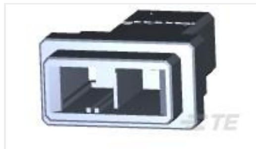
TE Part #2-179552-2 DYNAMIC D-3200S TAB HSG 2P K/Y