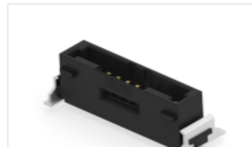
TE Part #474819-E SRCP 1,27 10 M 1-KS SMD 137 E1 094 * GU-