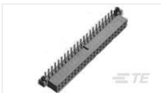
TE Part #4-1470108-6 2.0mm Pitch Box Header,R/A,Dip 16p