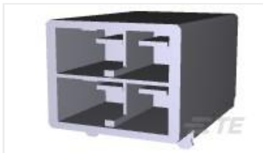
TE Part #2-1123309-2 DYNAMIC D-5 HDR H ASSY 4P YY