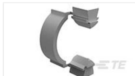
TE Part #1740261-2 NECTOR S RING CLIP BLACK