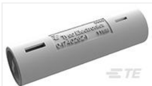
TE Part #1740262-1 NECTOR S OUTLET HV-1 WHITE