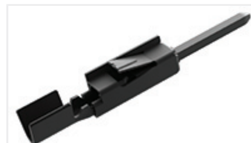
TE Part #1740335-1 MICRO QUADLOK SYSTEM PIN CONTA