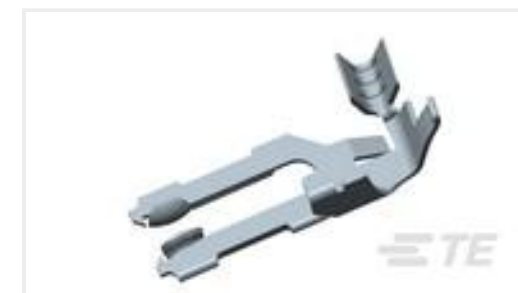
TE Part #926770-1 MT.EDGE CRIMP CONT.