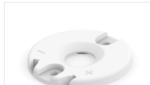
TE Part #2213678-5 Z35 MINI LED HOLDER 13.5*13.5MM PANHEAD