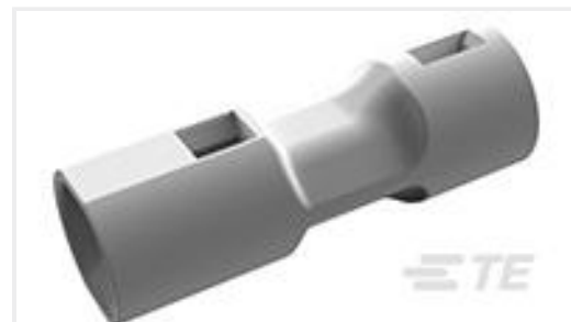
TE Part #1740260-2 NECTOR S TUBE BLACK