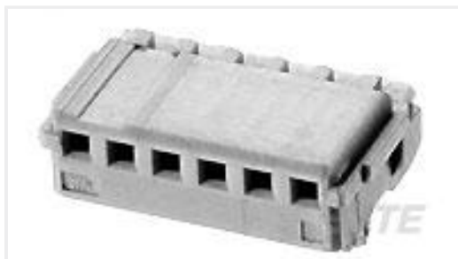
TE Part #353908-2 CT REC HSG 2P CRIMP TYPE WHITE