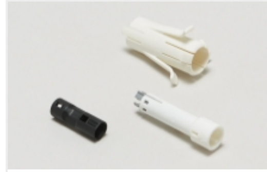
Plug & Socket Lighting Connector Accessories(42)