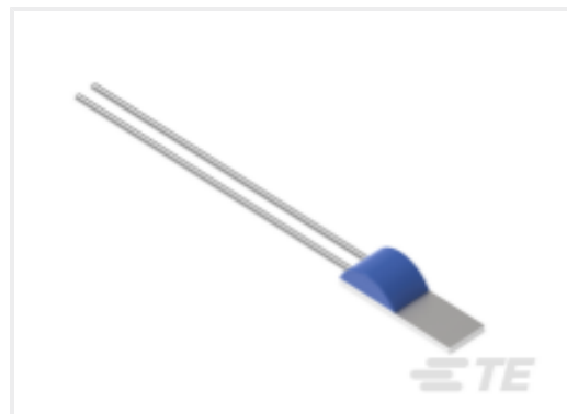
TE Part #NB-PTCO-188 Pt100, 1.2x4.0, Class T, PTFM101T1A0