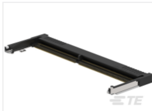
TE Part #2309407-2 DDR4 SODIMM 260P 4.0H STD