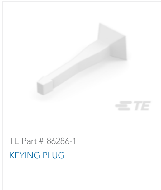
TE Part # 86286-1 KEYING PLUG