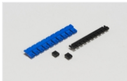
Board-to-Board Jumpers & Shunts(5)