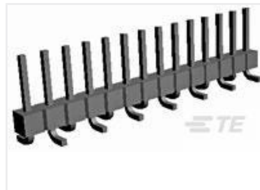
TE Part #1241150-4 4P MOD II BREAK AWAY HDR, SMD, BLISTER