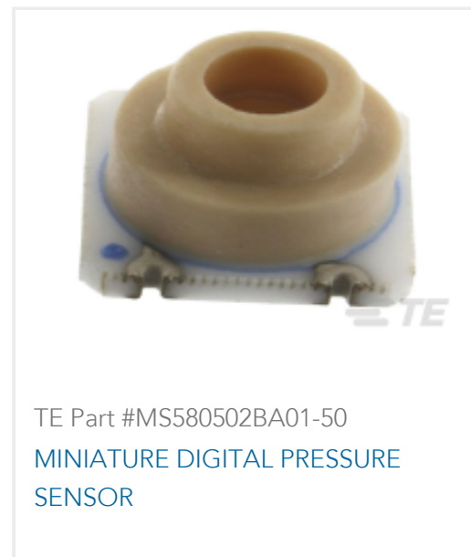
TE Part #MS580502BA01-50 MINIATURE DIGITAL PRESSURE SENSOR