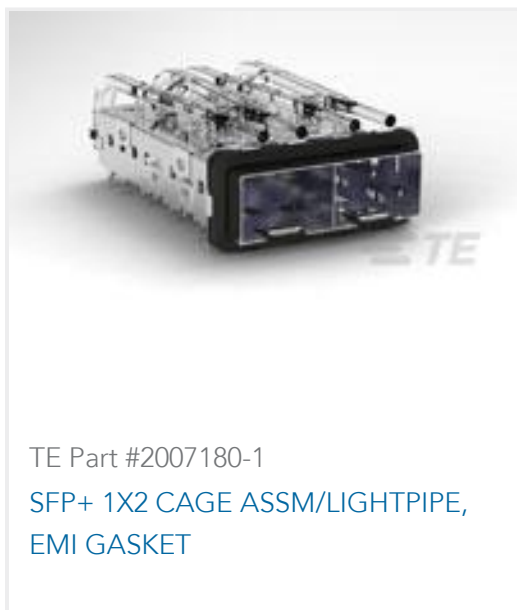
TE Part #2007180-1 SFP+ 1X2 CAGE ASSM/LIGHTPIPE, EMI GASKET