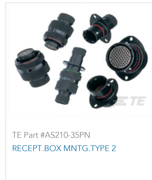
TE Part #AS210-35PN RECEPT.BOX MNTG.TYPE 2