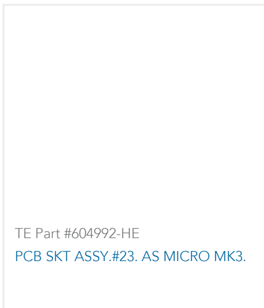
TE Part #604992-HE PCB SKT ASSY.#23. AS MICRO MK3.