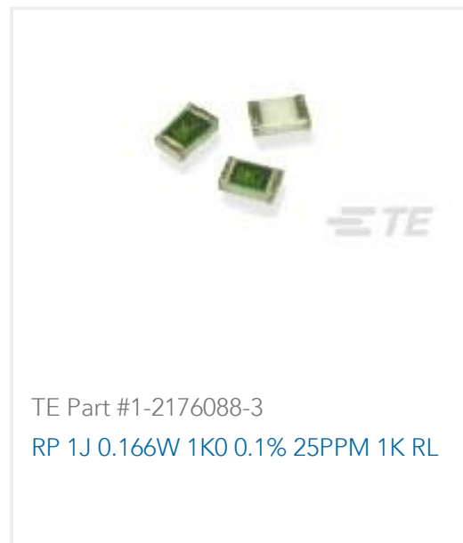
TE Part #1-2176088-3 RP 1J 0.166W 1K0 0.1% 25PPM 1K RL