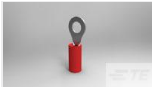
TE Part #171508-5 PIDG RING UL.CSA(22-16)