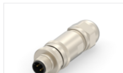
TE Part #T4111511041-000 M12 M, 4P GOLD D_CODE S SHIELDED PG7