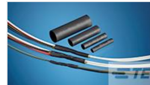
TE Part #0989076002 RBK-ILS-125-NR2-0-50MM