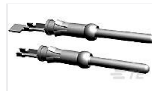
TE Part #1-66359-9 III+PIN,18-14,TIN,STRIP