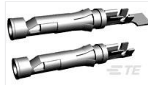
TE Part #1-66358-7 III+ SKT,18-14,TIN ,STRIP