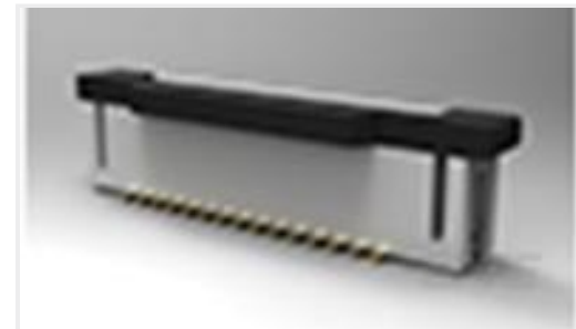
TE Part #1734248-9 1.0 FPC, ZIF V/T, SMT, 9P