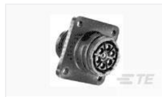
TE Part #211398-1 CPC RECPT. SIZE 13-7