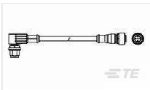
TE Part #1-2273122-2 M12 angled plug to M12 strgt socket AA