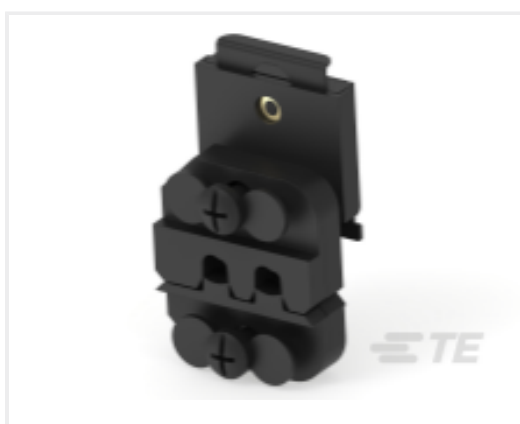
TE Part #2378809-2 SDE F MCON 1.2 18-20 DIE SET