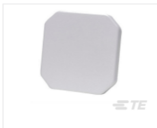
TE Part #S9025PRNF Panel,RHCP,FIXED,NF 902-928MHz, 5dBiC,flu