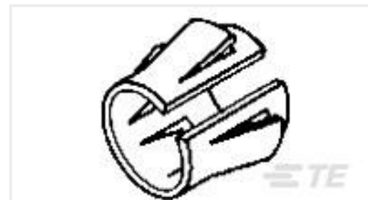
TE Part #201142-2 RETENTION SPRING,PLTD