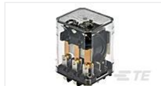
TE Part #5-1393117-6 KUP-11D55-12=KU