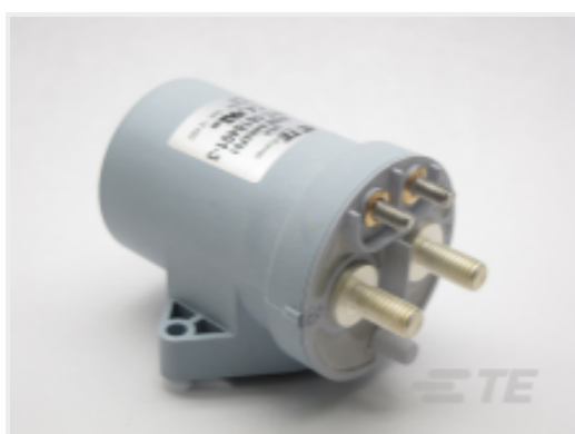
TE Part #4-1618414-4 LEV200AKNAA=RELAY, SPST-NO