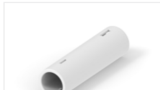
TE Part #293387-2 NECTOR S OUTLET HV-4 WHITE