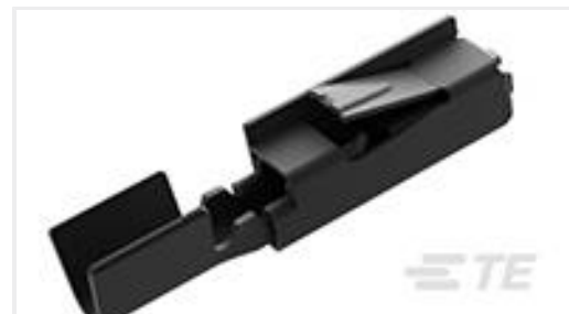
TE Part #1740336-4 MICRO QUADLOK SYSTEM SOCKET CONTACT