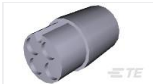
TE Part #925076 4W CIRCULAR MATE-N-LOK SOCKET HSG NAT