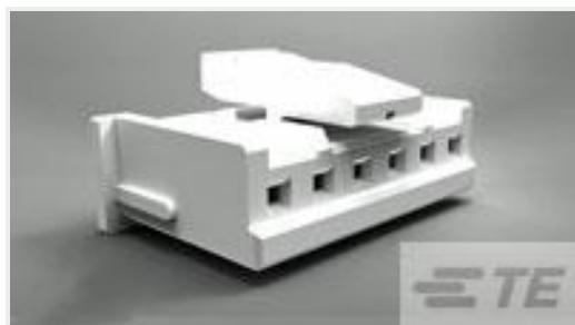
TE Part #1969442-4 EP 2.5 TPA Housing, 4 Pos