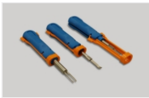
Insertion & Extraction Tools(3)