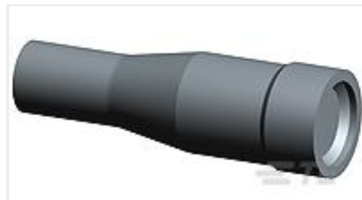
TE Part #293284-1 NECTOR S BUS BAR BOOT