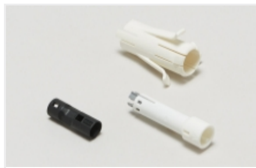
Plug & Socket Lighting Connector Accessories(42)