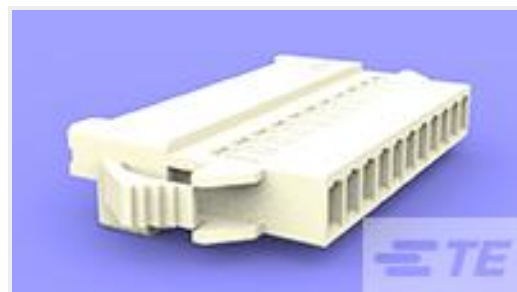
TE Part #1969590-4 HSG, REC, PANEL MOUNT, SINGLE ROW, EP2.5