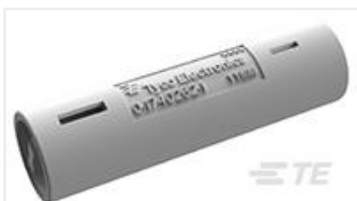
TE Part #1740262-2 NECTOR S OUTLET HV-1 BLACK