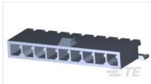
TE Part #2-1445084-9 micro mnl hdr Assy s/row au lf