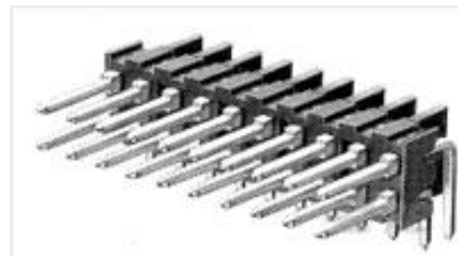
TE Part #1-87230-0 20 MODII HDR DRRA UNSHRD .100