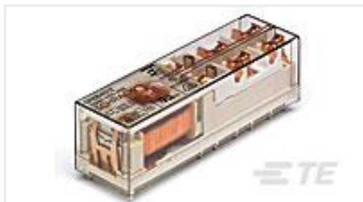
TE Part #3-1415018-1 SR6A4021 - V23050-A1021-A533