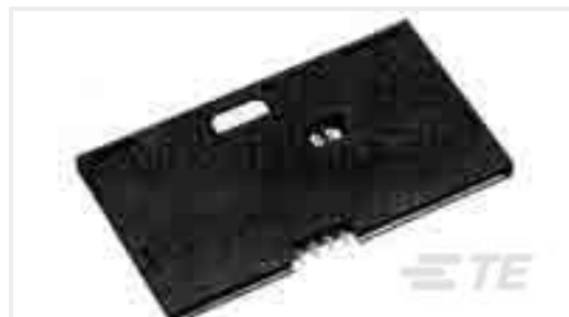
TE Part #5145300-2 SMT CARD RCPT,8 POS, W/ COVER