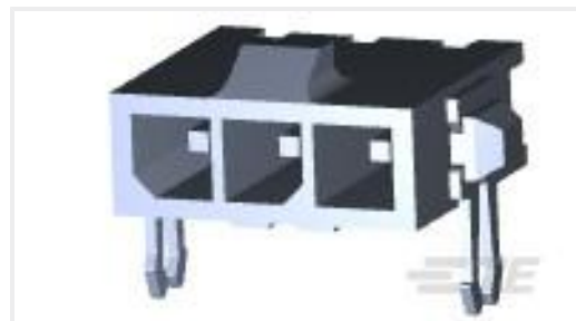
TE Part #2-1445056-3 MICRO MNL HDR ASSY SINGLE ROW