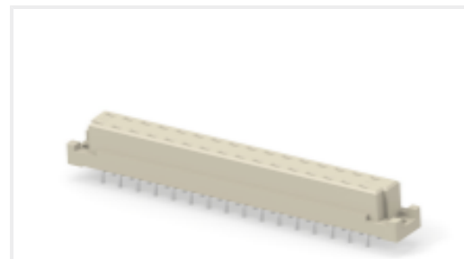
TE Part #354646-E STVD 32 F AC GG 7-02 EE 4,5 * 247 E 172