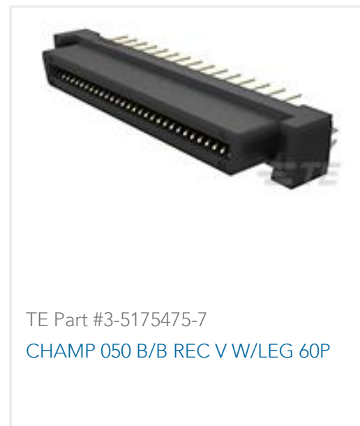
TE Part #3-5175475-7 CHAMP 050 B/B REC V W/LEG 60P