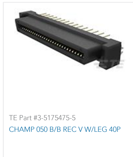
TE Part #3-5175475-5 CHAMP 050 B/B REC V W/LEG 40P