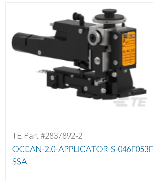
TE Part #2837892-2 OCEAN-2.0-APPLICATOR-S-046F053F- SSA