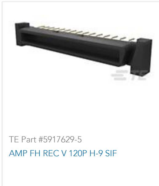
TE Part #5917629-5 AMP FH REC V 120P H-9 SIF