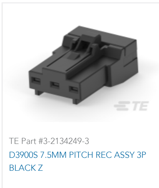
TE Part #3-2134249-3 D3900S 7.5MM PITCH REC ASSY 3P BLACK Z