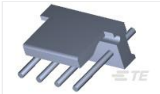
TE Part #3-641209-4 04P MTA156 HDR ASSY FL ST LF