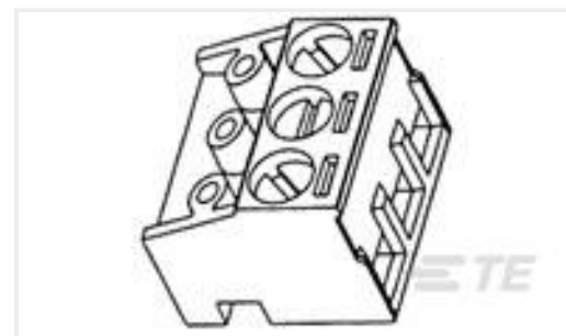
TE Part #282830-6 TERMI-BLOK PLUG 90&180DEG 6P.5