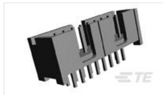
TE Part #1-103308-0 050 LOPRO HDR SP 15DP