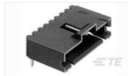
TE Part #6-103635-7 18 MTE HDR SRRA LTCH.100CL LF