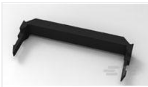
TE Part #499252-5 010 STRAIN RELIEF A-L RCPT