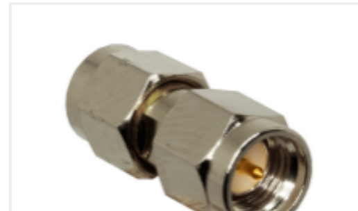
TE Part #ADP-SMAM-SMAM SMA Plug to SMA Plug