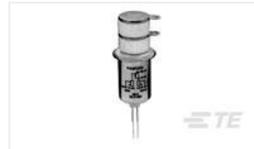
TE Part #5-1618240-0 K44P334=RELAY, VACUUM SPST LAT