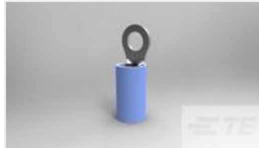
TE Part #320561 TERMINAL,PIDG R 16-14 6