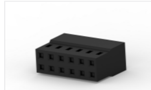
TE Part #1-2316108-2 12P,2MM,REC,HSG,DR,CRIMP,PLAIN, BOX