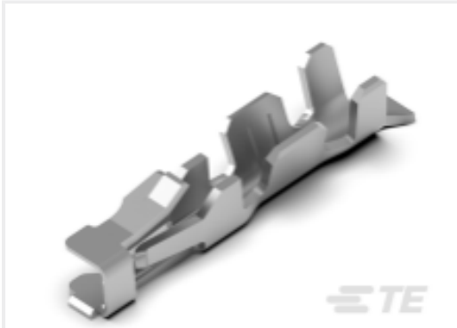
TE Part #2-2316113-3 2MM,REC,CNT,CRIMP,24-28AWG,TIN, LP