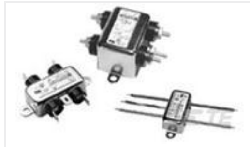
TE Part #1-6609021-0 10VB3=F7129 S0