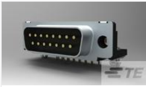
TE Part #5747841-4 15 MSFL PLUG RA 318 (IN,FM,BL)