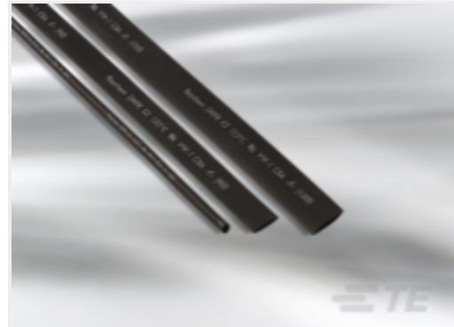
TE Part #EM6977-000 X4-0.6-0-SP