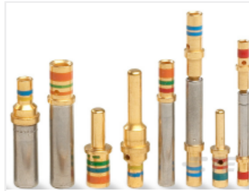
TE Part #0641-3-1231L CONT PIN